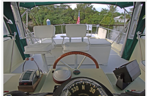
Flybridge Facing Aft