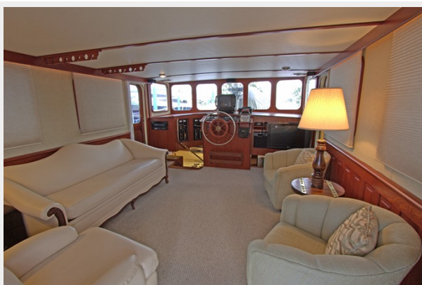
Salon Facing Forward