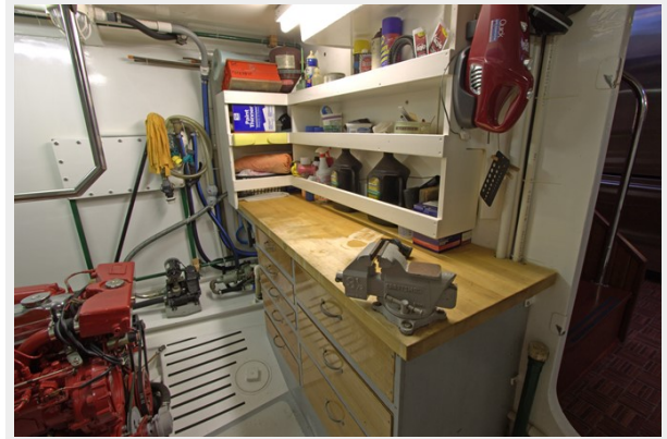
Engine Room Workspace