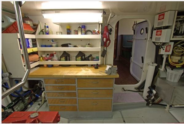
Access to Stand-Up Engine Room