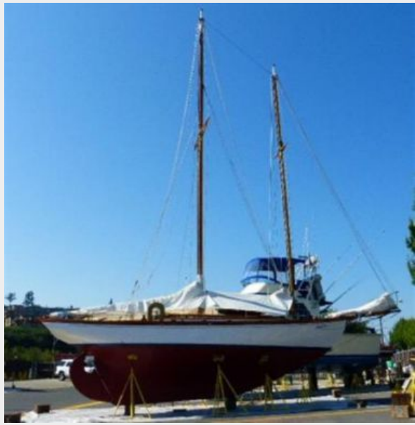
On the Hard II