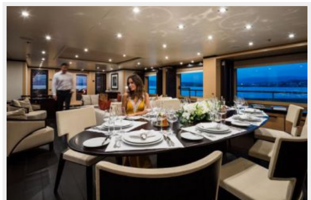
GRACE - Main deck dining