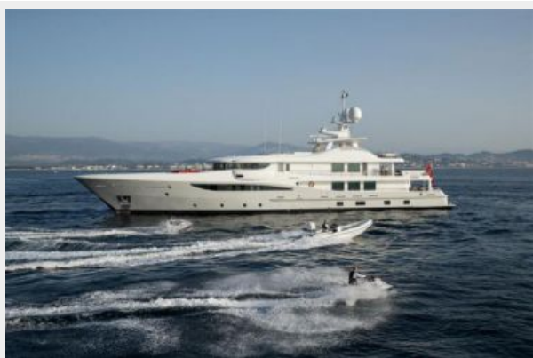
GRACE - Still with toys