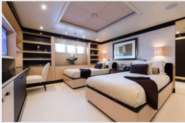
GRACE - Twin cabin