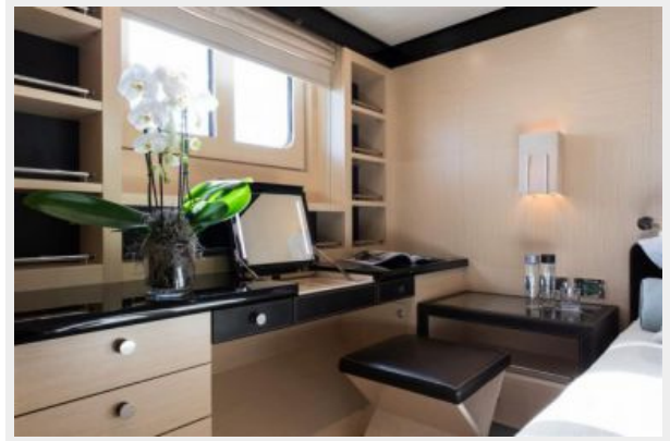
GRACE - VIP cabin desk