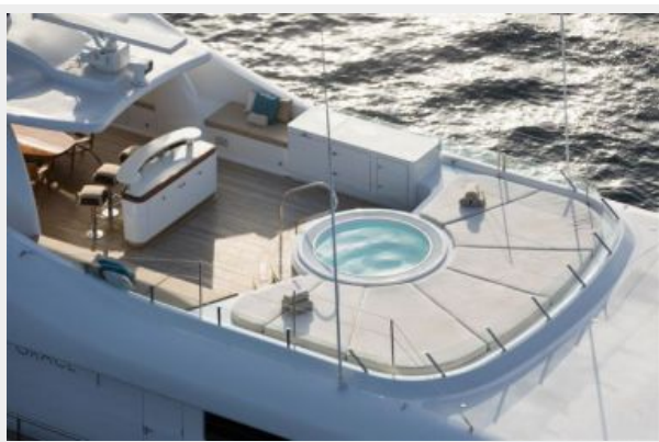
GRACE - Sun deck and Jacuzzi