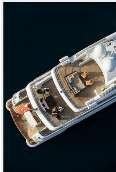
GRACE - Aerial decks