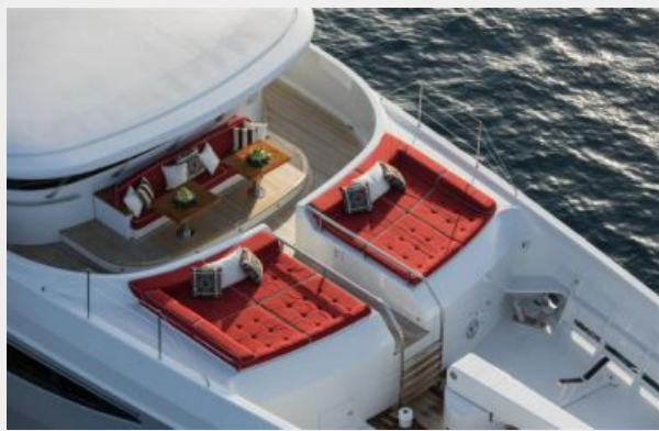
GRACE - Upper deck forward