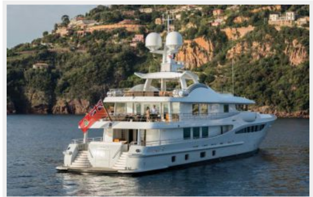
GRACE - Still