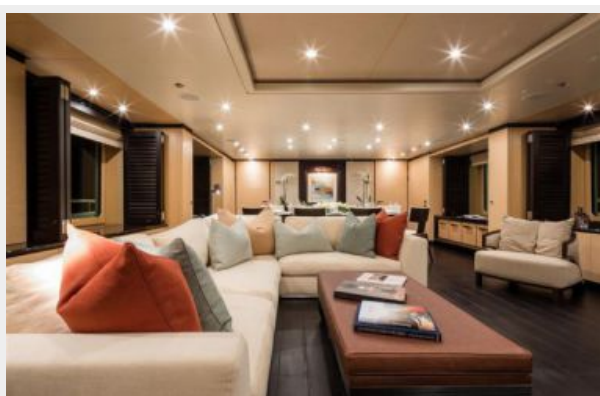
GRACE - Main deck salon