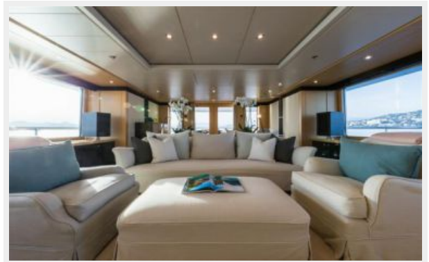
GRACE - Upper deck salon general