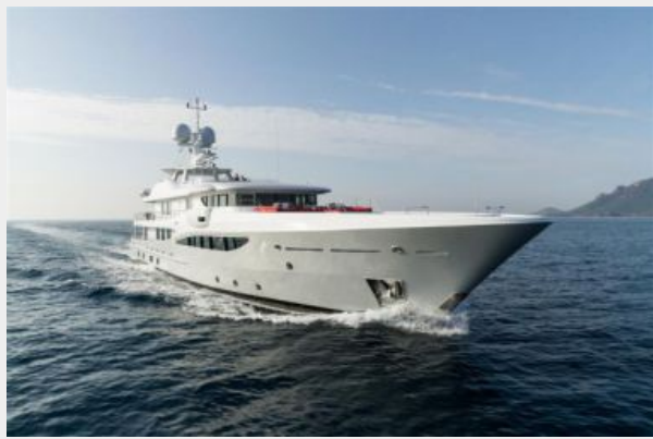
GRACE - Running 3