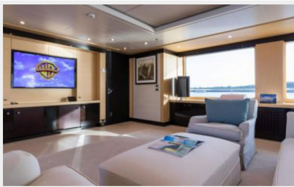
GRACE - Upper deck salon