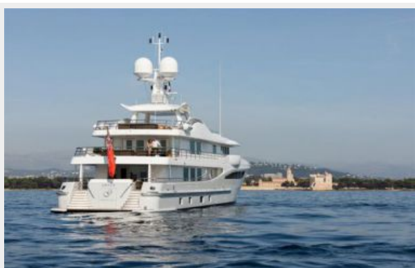
GRACE - General aft veiw