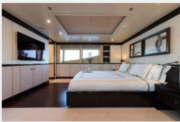
GRACE -Master cabin