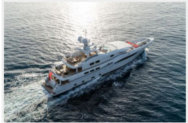
GRACE - Running