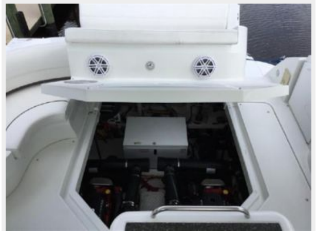
Engine Room Access