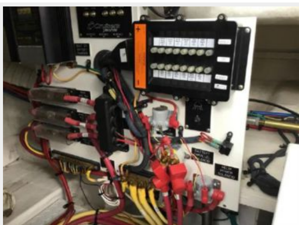
Fuse Panel And Breakers