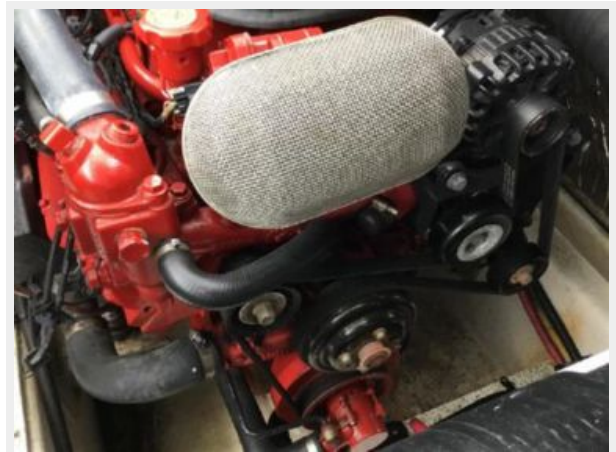
Volvo 8.1 GXI