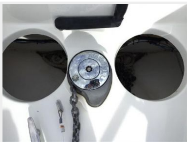
Fender Storage - Anchor Locker