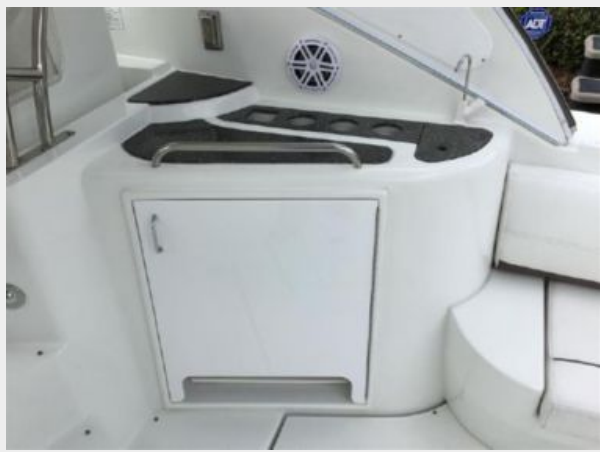
Cockpit Wet Bar