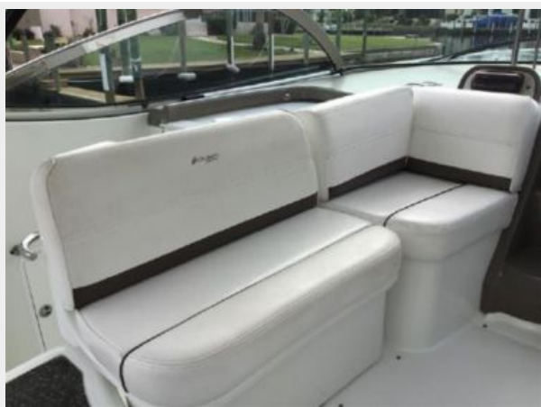
Upper Cockpit Seats