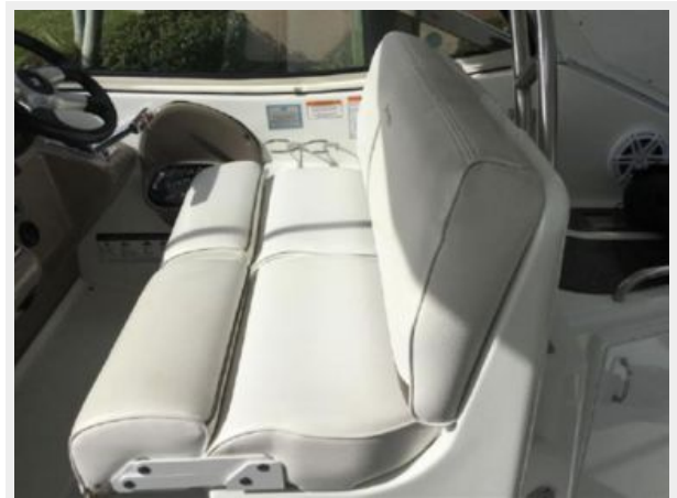
Double Wide Helm Seat