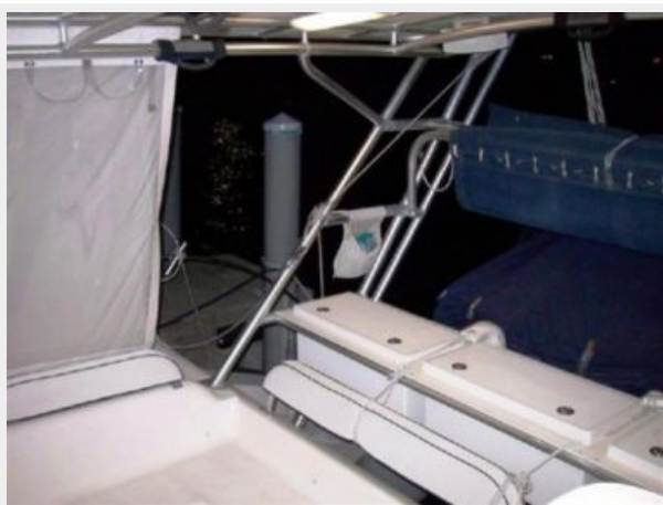
Cockpit Seating and Storage Boxes