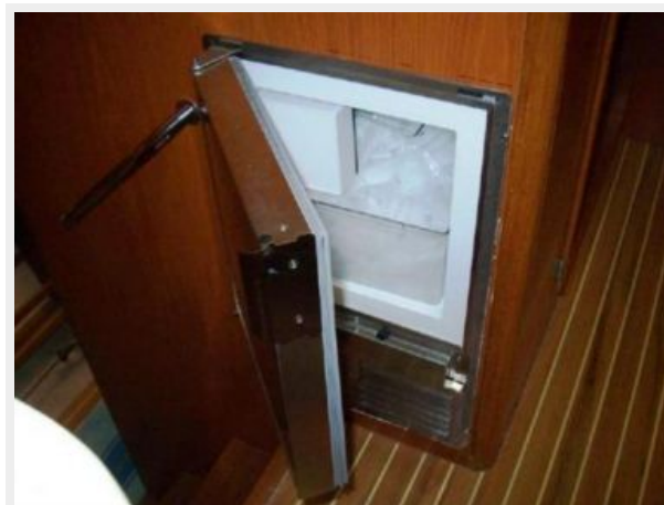
Galley Ice Maker