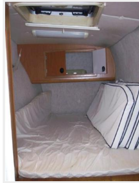
Starboard Hull Forward Guest Stateroom