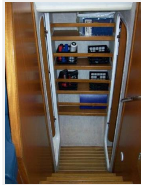
Starboard Hull Entry with Bookcase