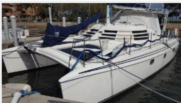
Port Side Bow View