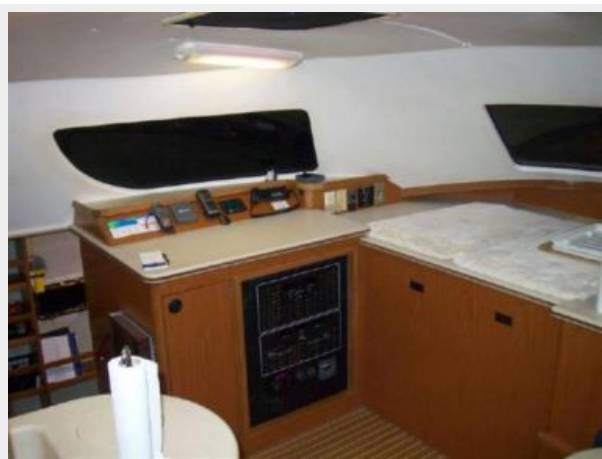
Salon Nav Station and Refrigerator / Freezer