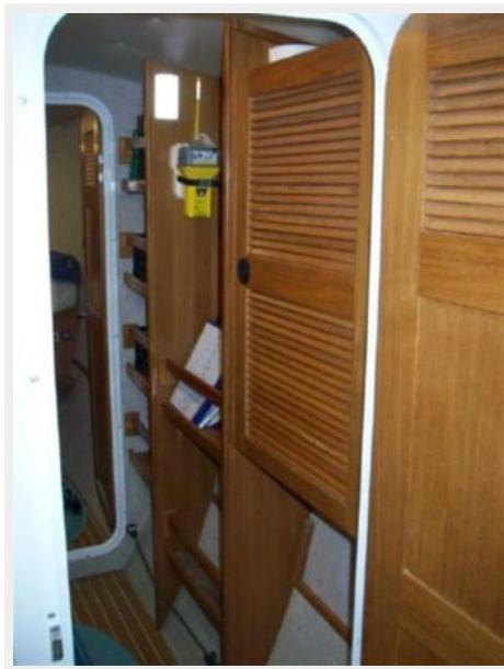
Port Hull Companionway Outboard Storage Looking Aft