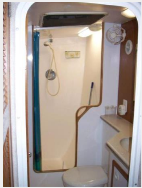
Port Hull Owner's Shower