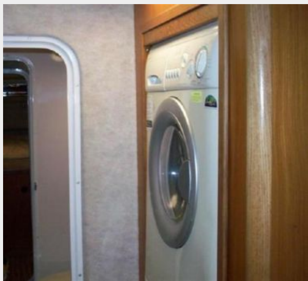
Washer / Dryer in Starboard Hull Forward Guest Stateroom