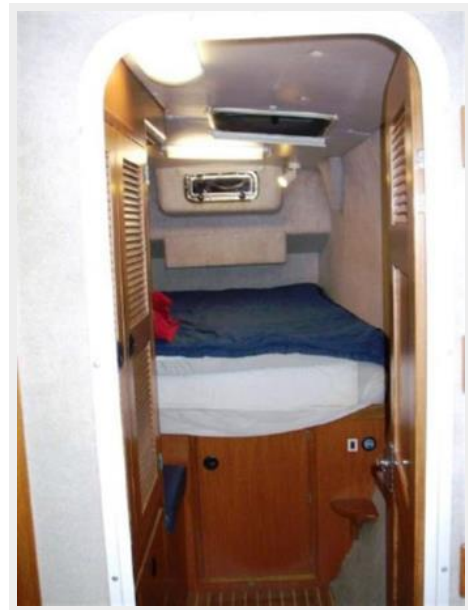
Port Hull Owner's Stateroom Storage