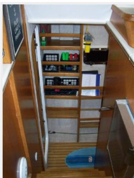
Port Hull Entry with Bookcases