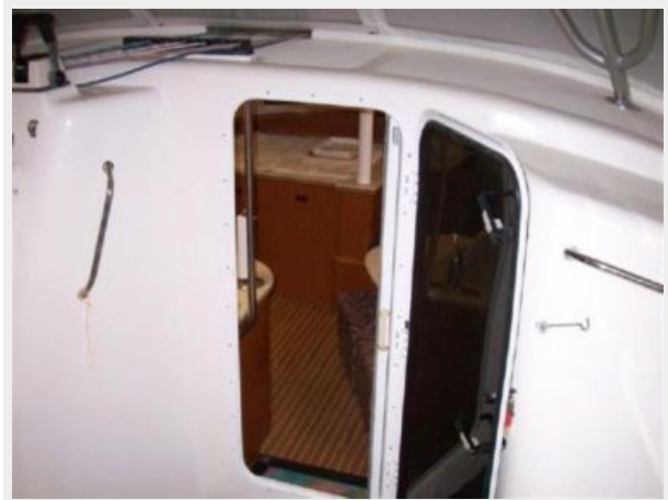
Cockpit Cabin Entry