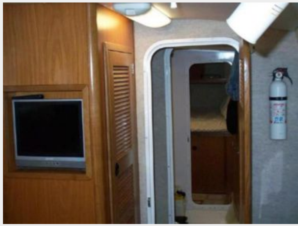
Starboard Hull Looking Forward from VIP Guest Stateroom