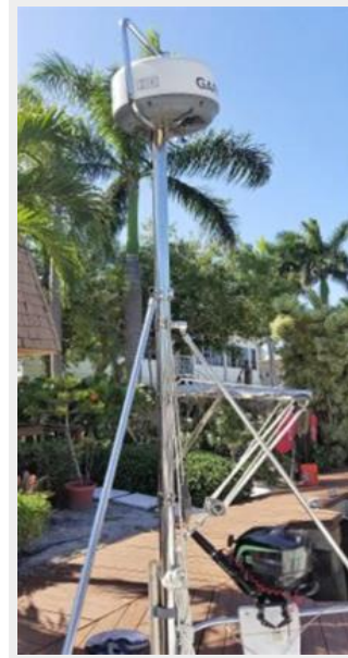
Gimbaled Radar mast w/outboard lift