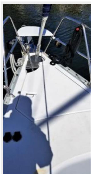
Roller furling drum below decks