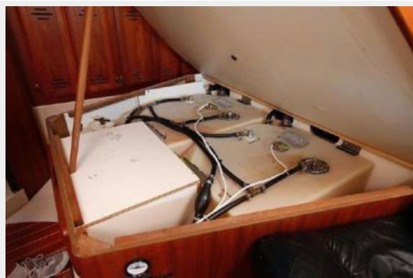
Master Stateroom newer tanks