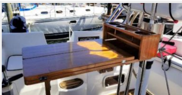
Cockpit Table - 2017