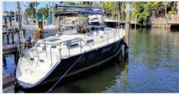
Profile without dingy davits