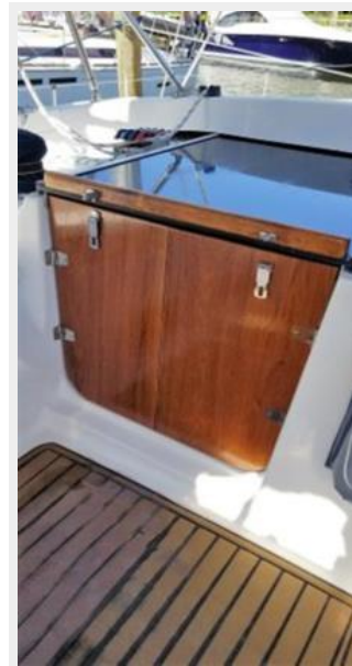
Custom wood doors - 2017