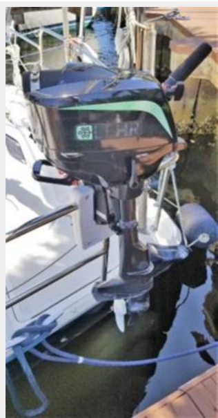
Propane Outboard Motor