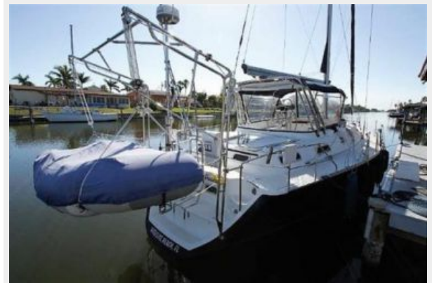
Dingy Davits removed and in storage