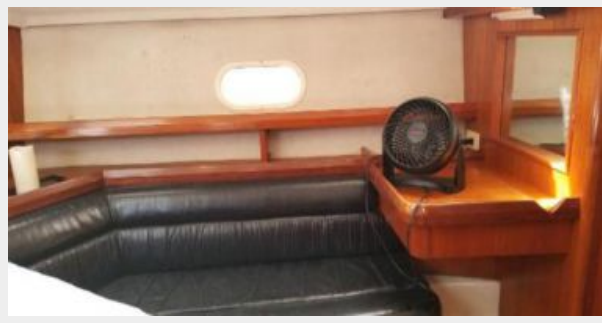
seating & desk in master stateroom