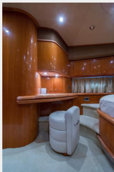
VIP Stateroom, Forward