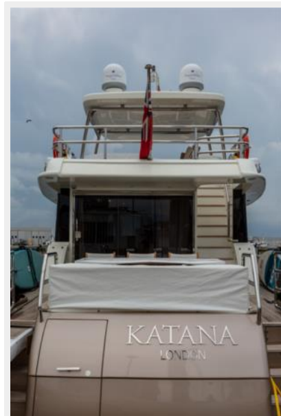
Exterior Azimut Magellano 76