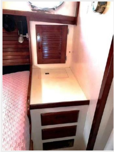
V-Berth Cabinetry_Stbd Aft