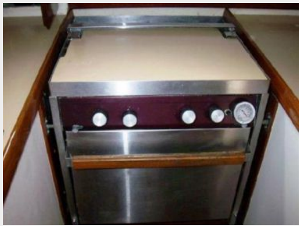
Galley SS Propane Stove