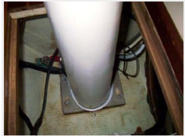
Updated Mast Step with Insulated Spacer