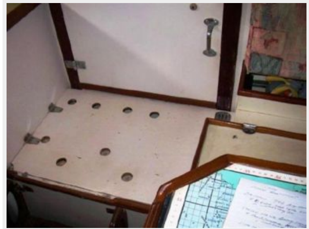
Freedom 1000 Inverter & Handheld VHF