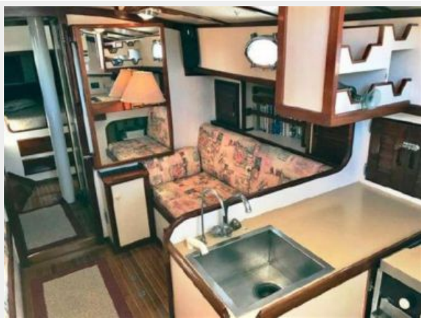
Salon & Galley_Stbd