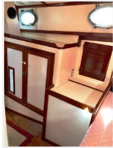
V-Berth Cabinetry_Port Aft