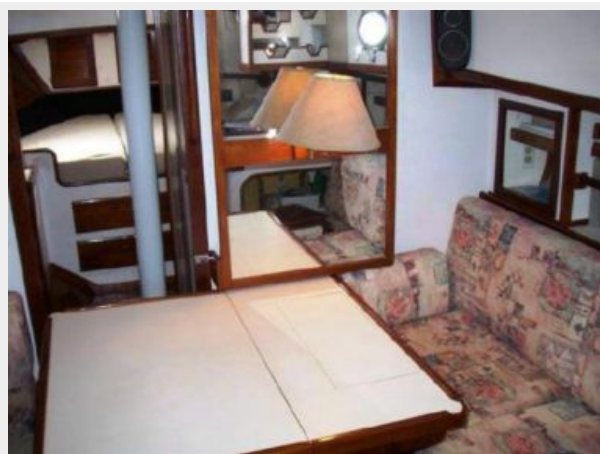
Salon Table Open