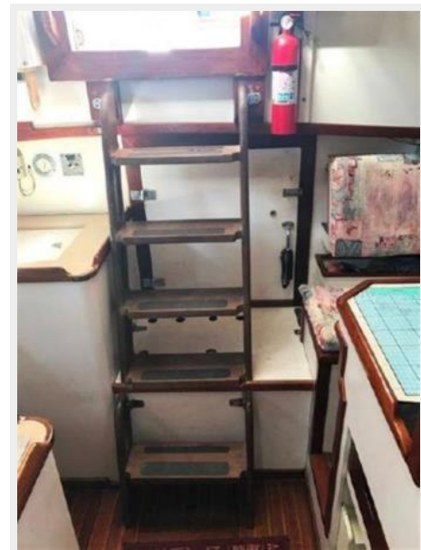
Companionway Ladder & Battery Case Closed