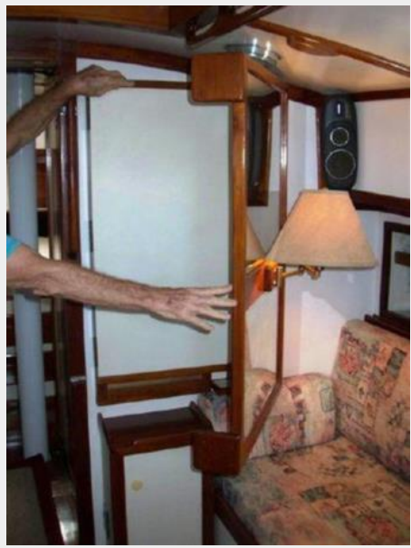
Salon_Hidden Folding Table