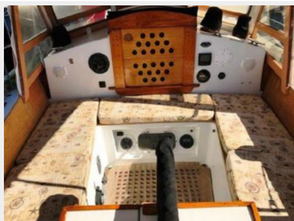
Cockpit Cushions & Companionway