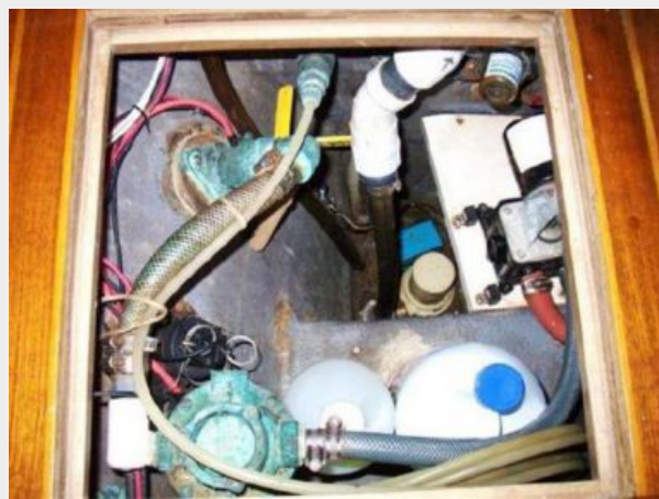
Bilges_Dry & Accessible