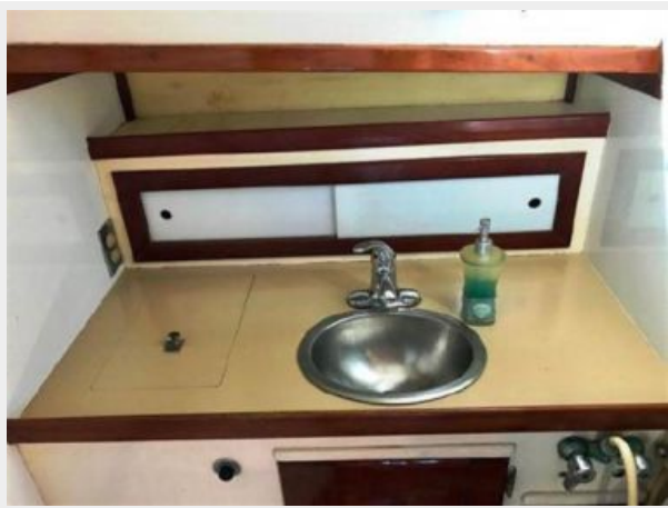
Head Vanity & Sink