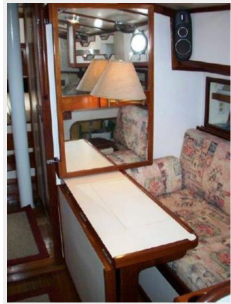
Salon Table Down_1 of 2 Leafs