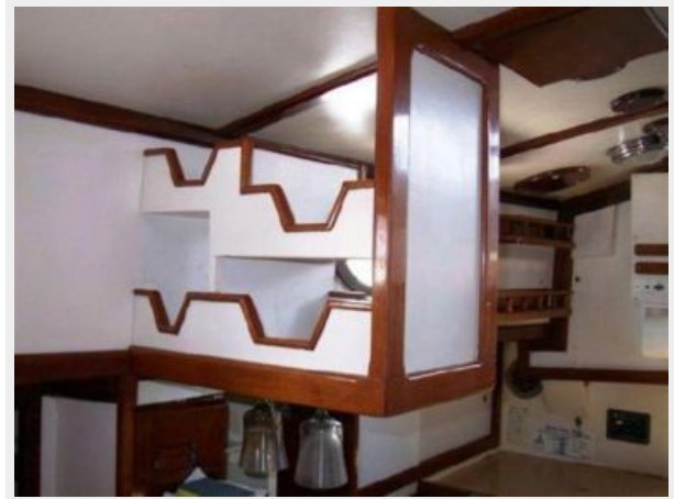
Companionway Ladder & Battery Case Closed