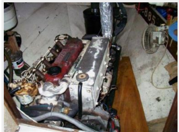
Engineroom_Isuzu 56hp Diesel Engine