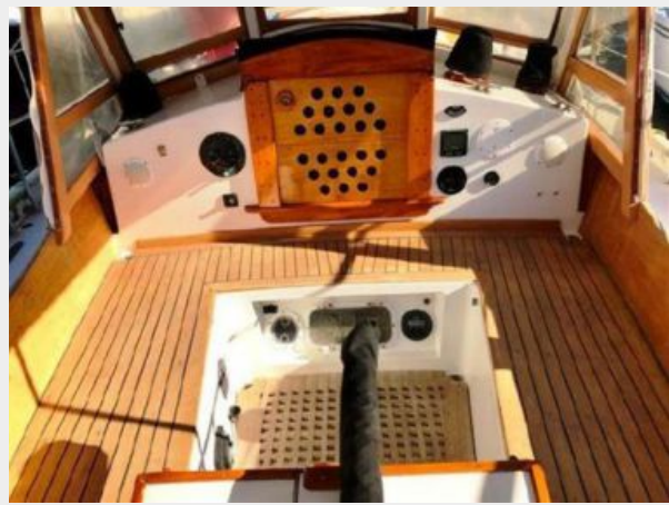
Cockpit Teak & Companionway