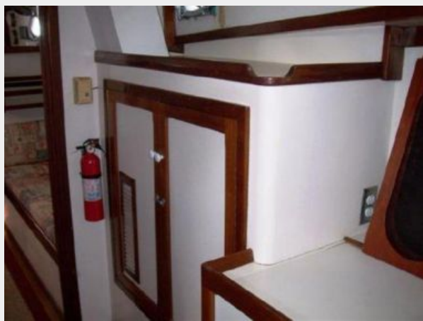
V-Berth Hanging Locker