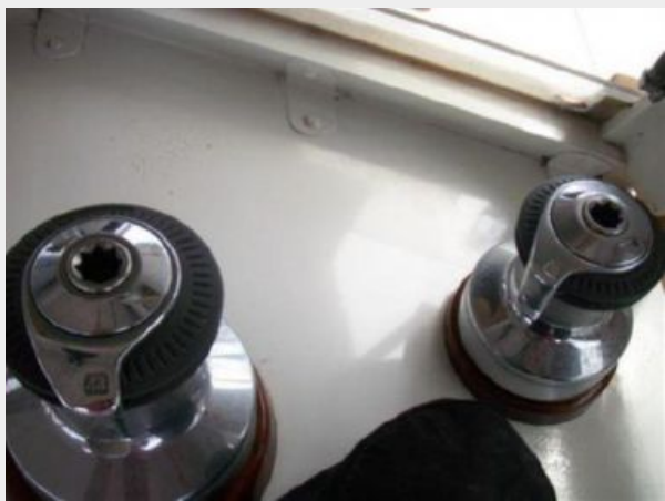
Lewmar 30 & 44 ST Mainsheet Winches_Cockpit