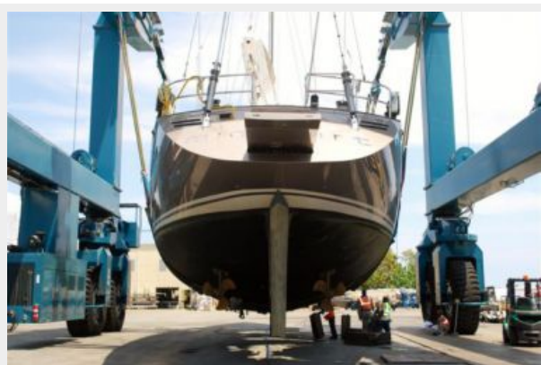
MINISKIRT - out of the water (3)