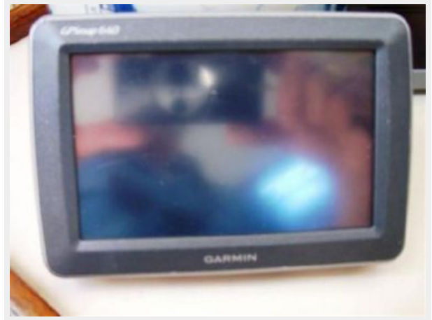
Garmin 640 GPS Display