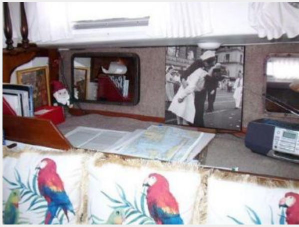
Salon_Storage Above Port Settee