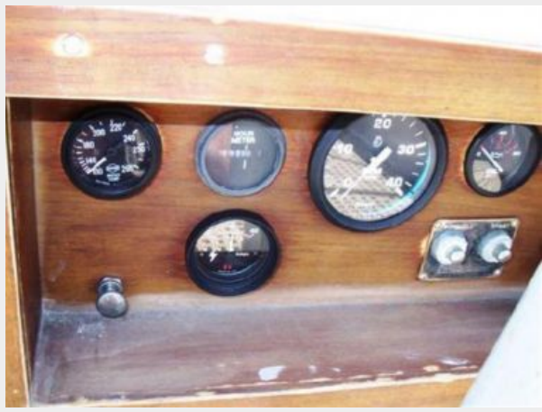
Engine Instrument Panel