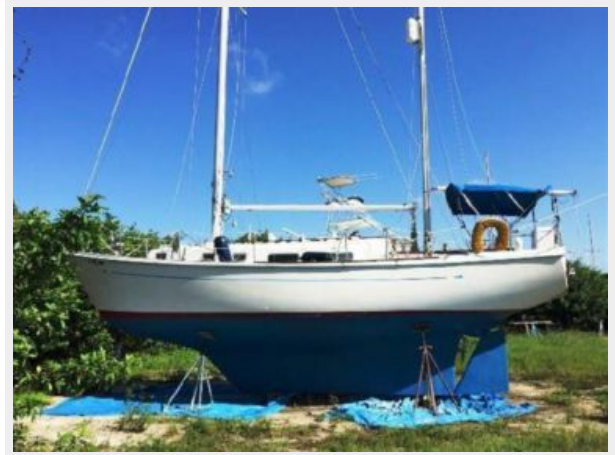
Profile_Port Hauled & Full Keel