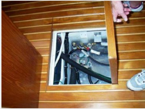
New 90 gal. Fuel Tank