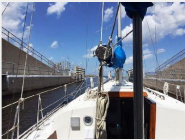
Wide Side Decks_Port