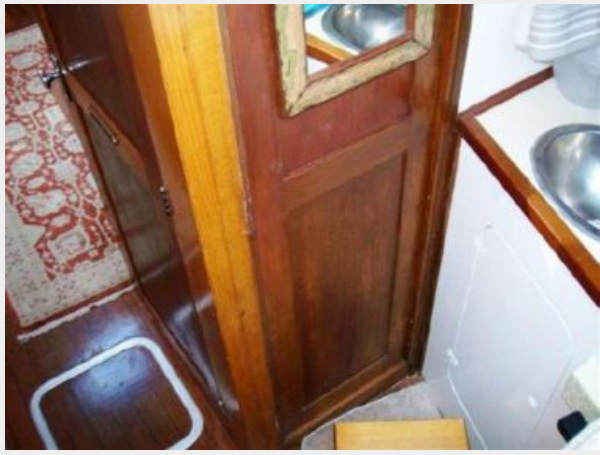
V-Berth Cabinetry_Aft Port