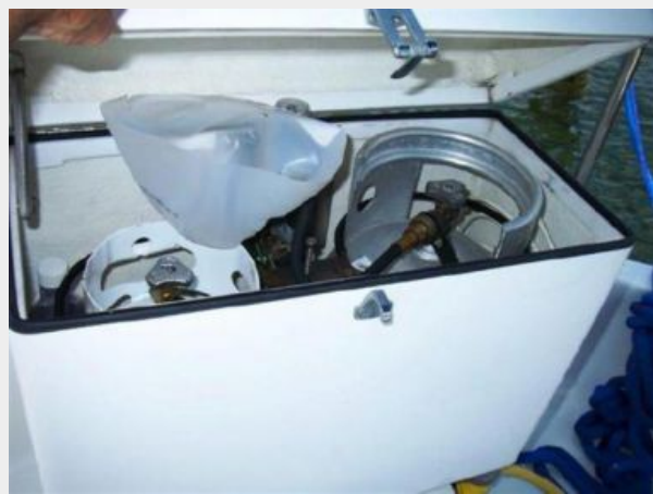
Propane Locker in Cockpit