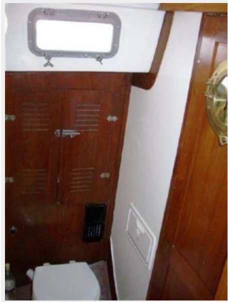
Head Cabinetry & Opening Port