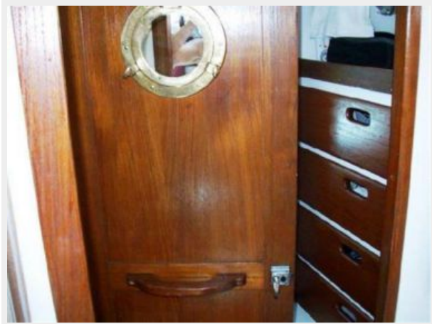
V-Berth Door & Drawers