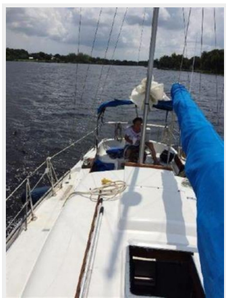
Cabintop & New Hatch Plexi