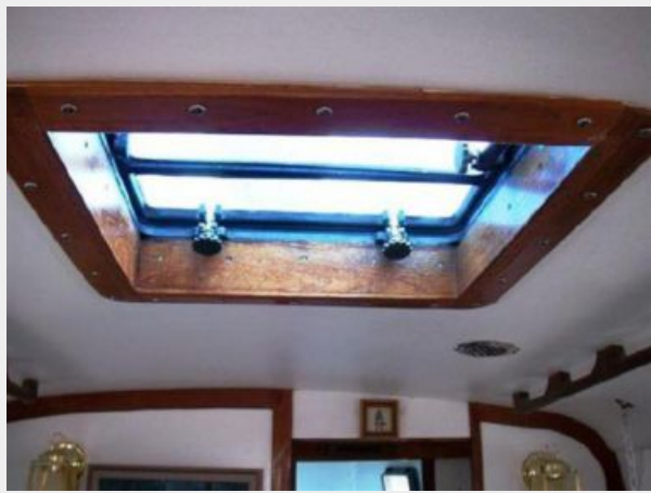
Salon Deck Hatch_New Plexi