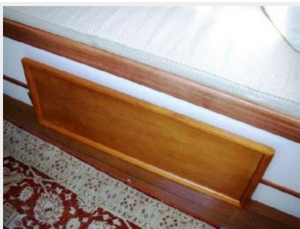
Salon Storage Under Settees