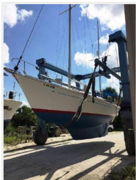
Profile_Port Bow in Slings