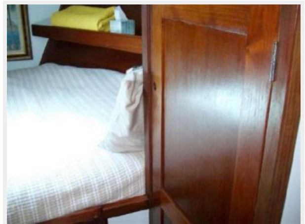
V-Berth Cabinet Closed_Stbd