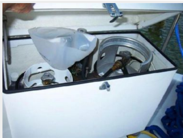
Propane Locker in Cockpit