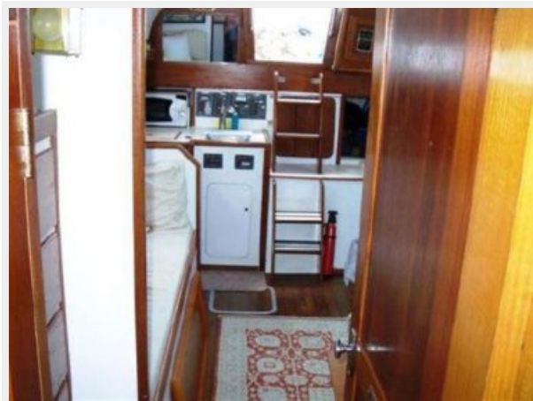
Salon View from V-Berth