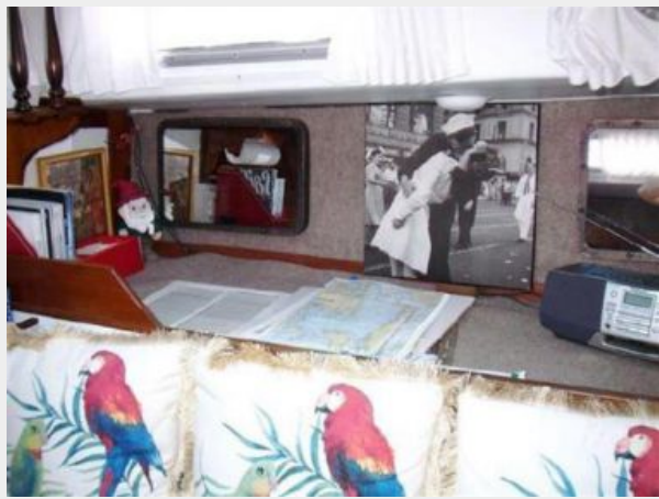
Salon_Storage Above Port Settee