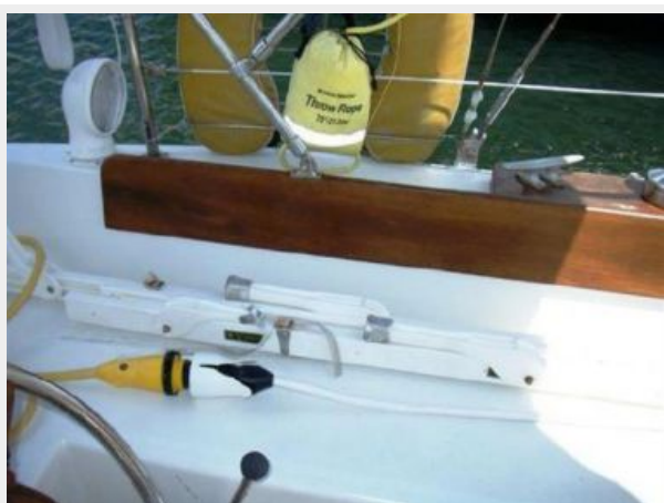
Cockpit Coaming & Smart Plugs