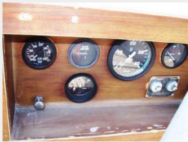
Engine Instrument Panel