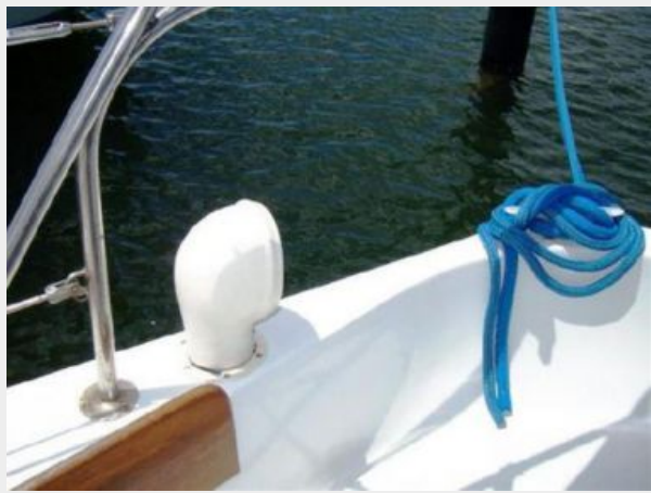
Cockpit Dorade Vent