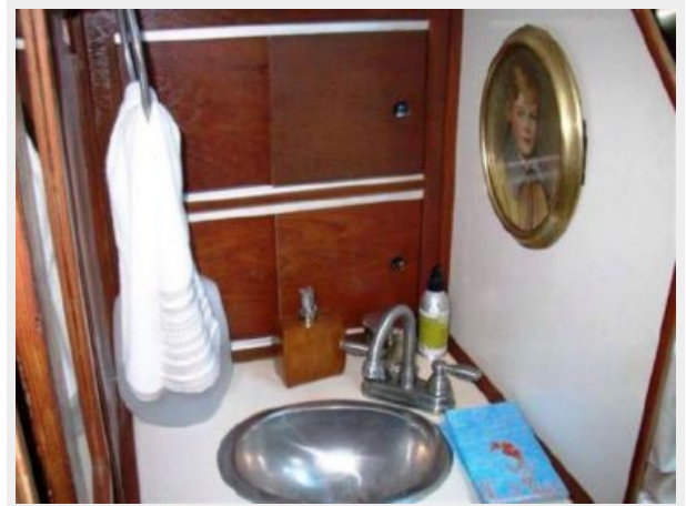
V-Berth Sink & Vanity_Port