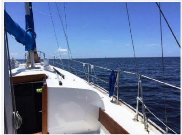
Wide Side Decks_Stbd