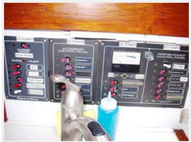
AC & DC Electrical Panels at Galley