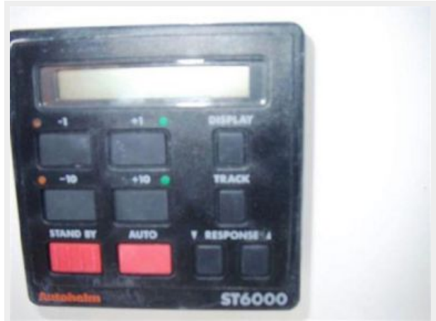
Autopilot Display & Control