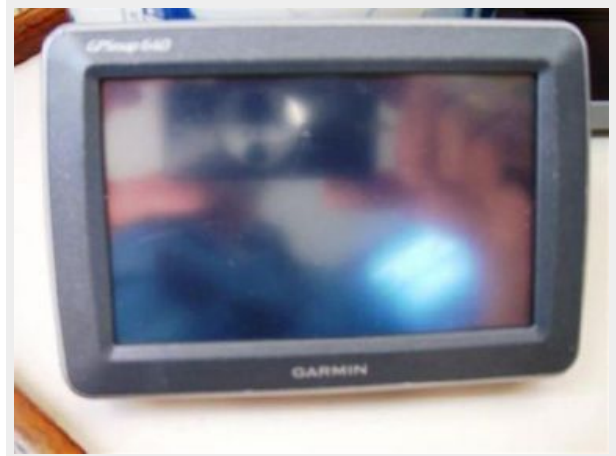
Garmin 640 GPS Display