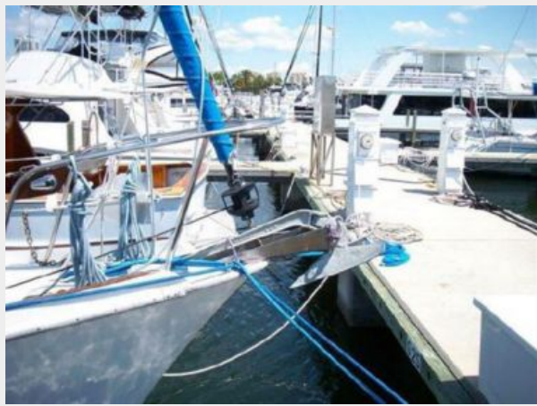
Profile_Bow Pulpit & Anchor