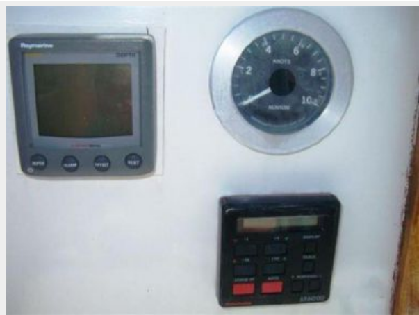
Digital Depth & Autopilot