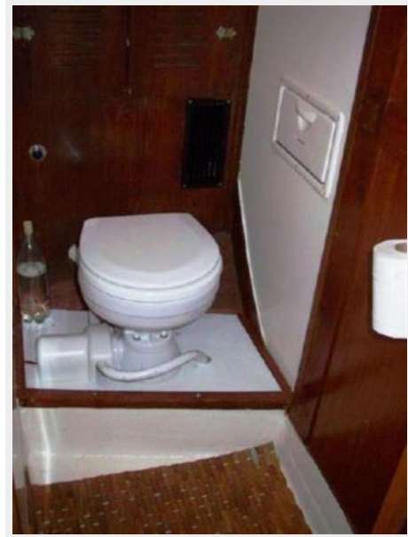
Head_Electric Toilet & Hot & Cold Shower