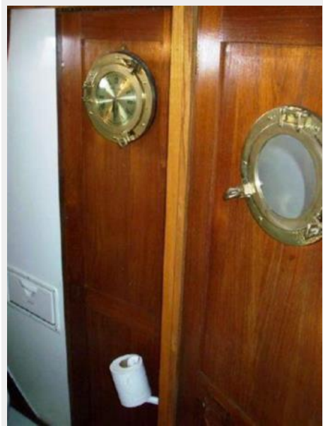
Head Door & Decor