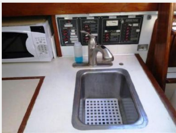
Galley_SS Sink & New Faucet