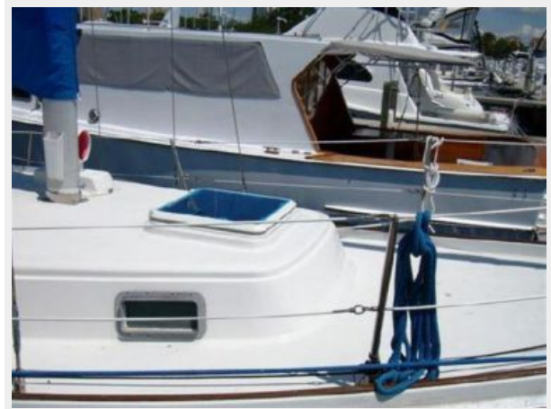
Foredeck & Cabintop