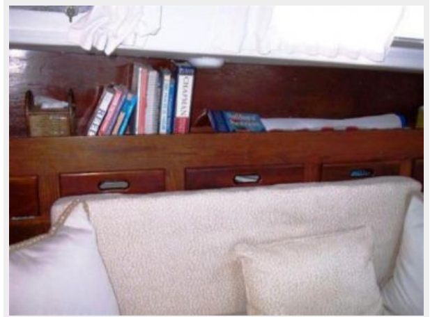
Salon_Storage Behind Stbd Settee