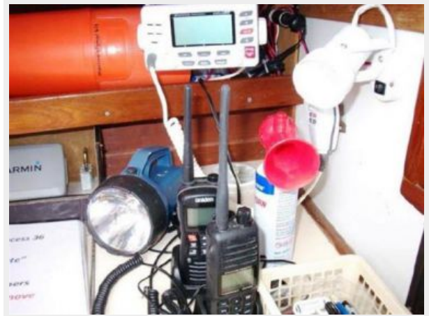
Nav Table_3 VHF Radios