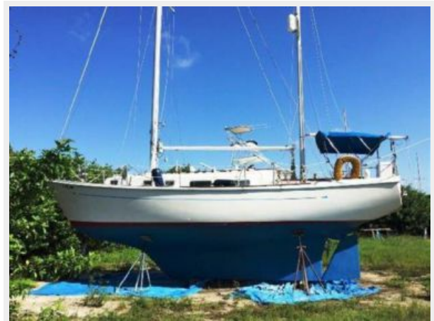
Profile_Port Hauled & Full Keel