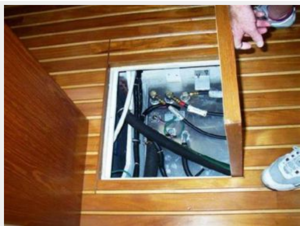
New 90 gal. Fuel Tank