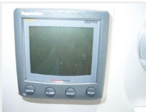
Digital Depth Display