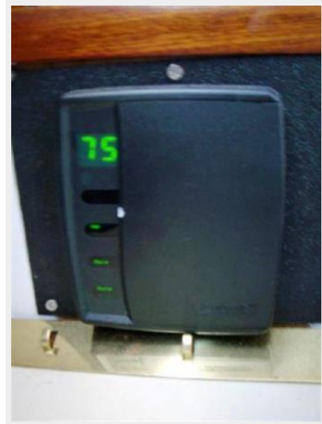
A/C_Digital Display Upgraded