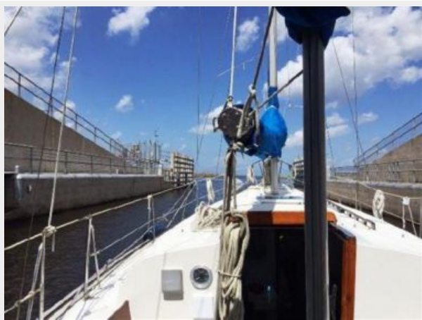
Wide Side Decks_Port