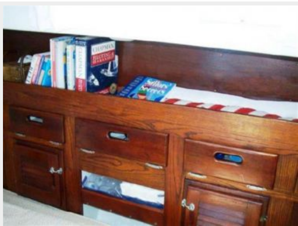
Salon_Storage Behind Stbd Backrest