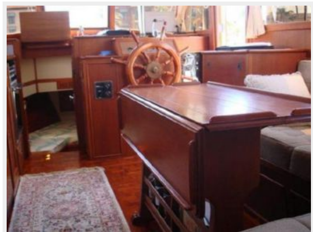
Salon / Dinette Table