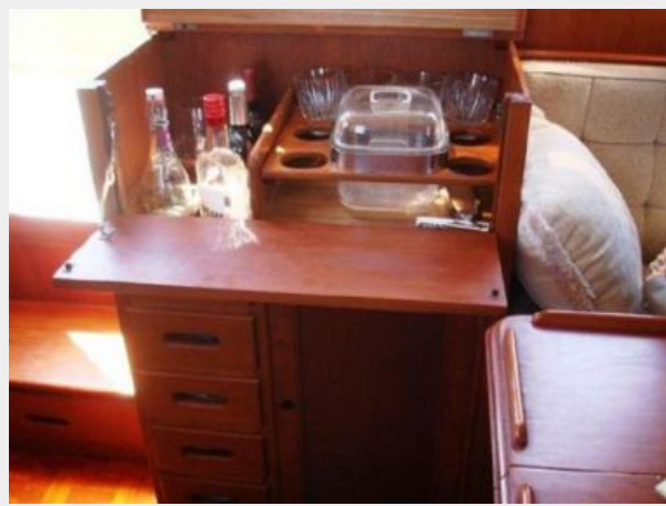
Salon Bar Cabinet