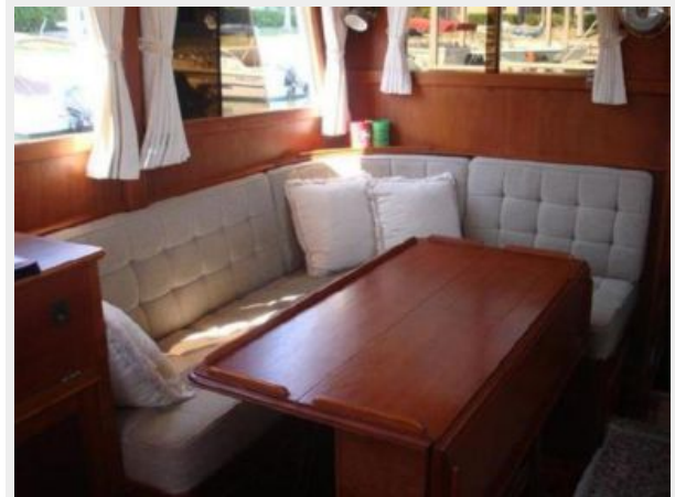
Salon / Dinette