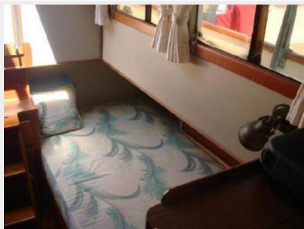
Port Master Stateroom Berth