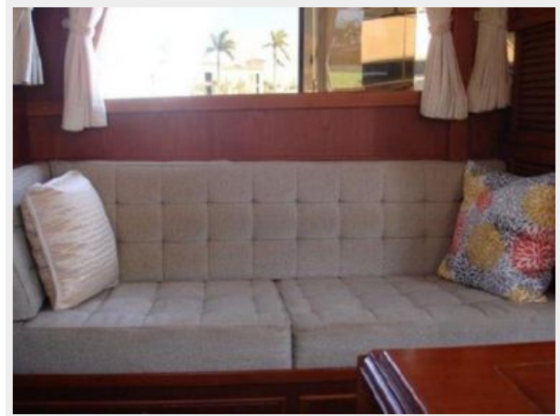
Port Side Salon Settee