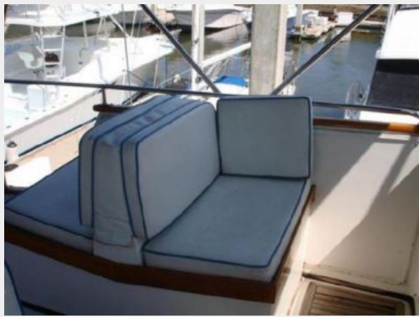
Flybridge Companion Helm Seating