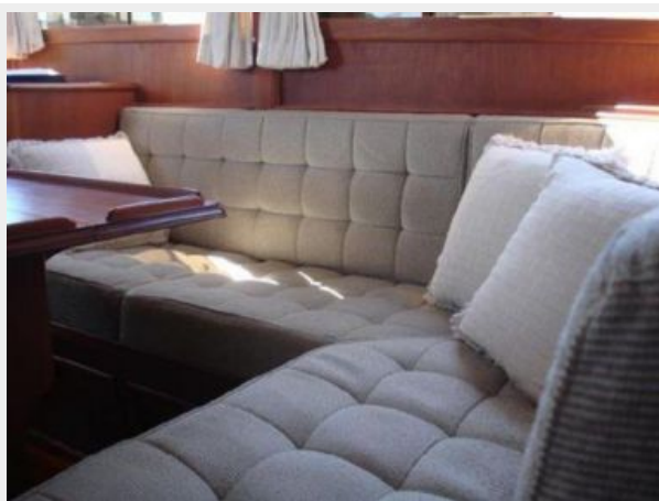
Salon / Dinette Seating