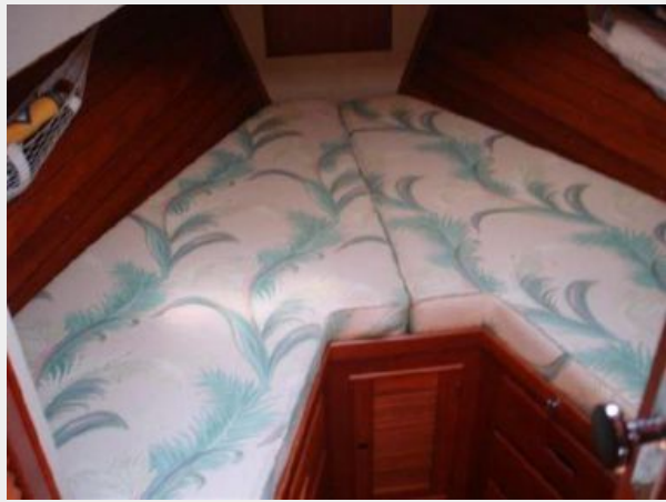
VIP Stateroom Berth