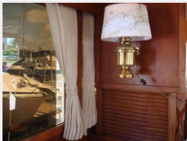
Port Side Salon