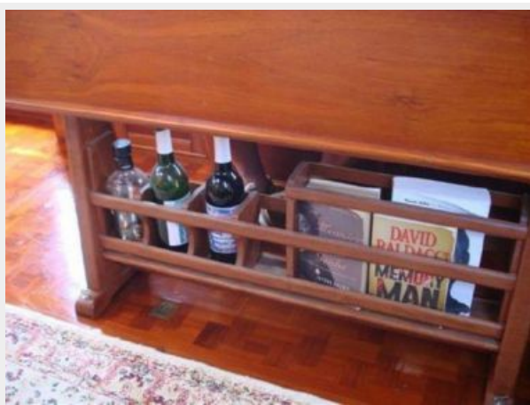
Dinette Table Storage