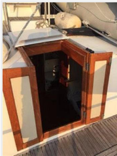
Aft Cabin Entrance