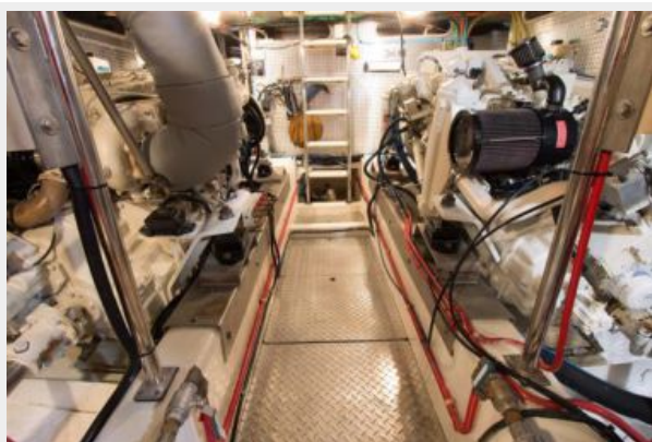
Engine Room Forward