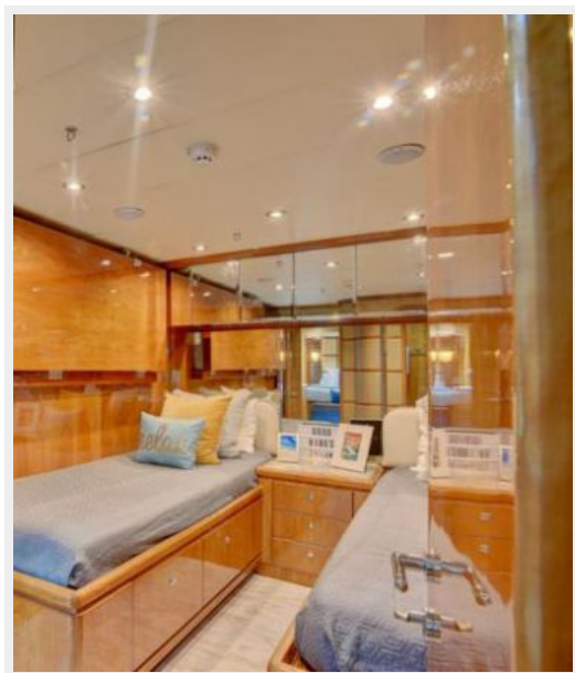
large - 46