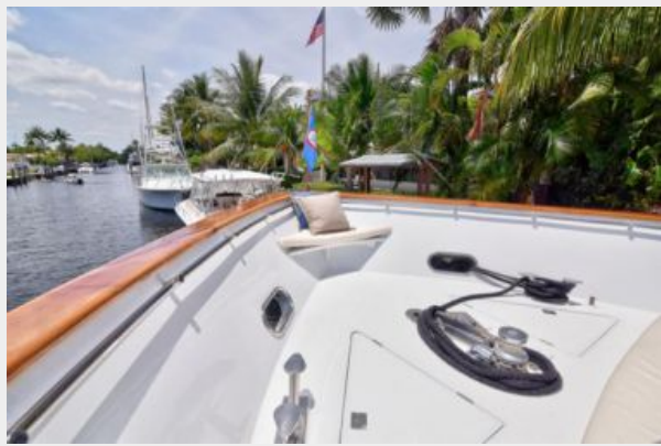
large - 64