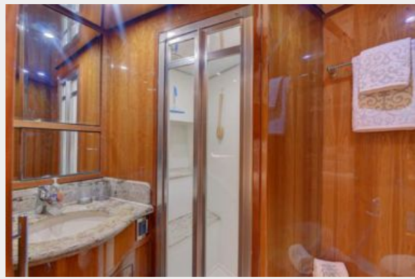
large - 59