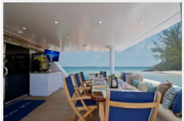
large - 4