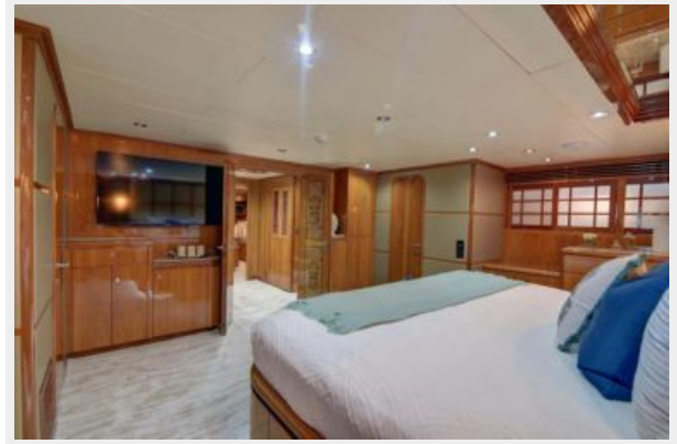
large - 54