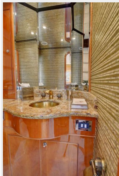
large - 66