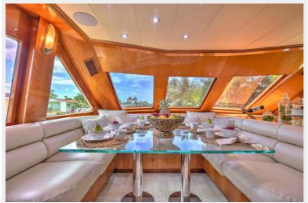
large - 17