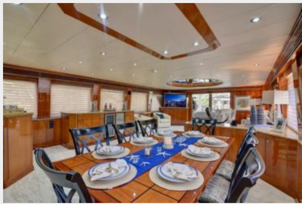
large - 15