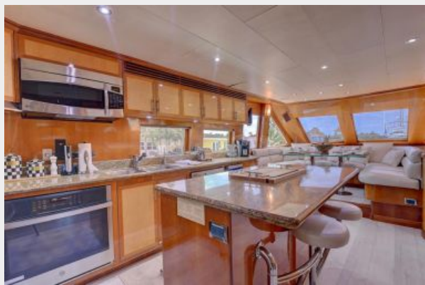
large - 67