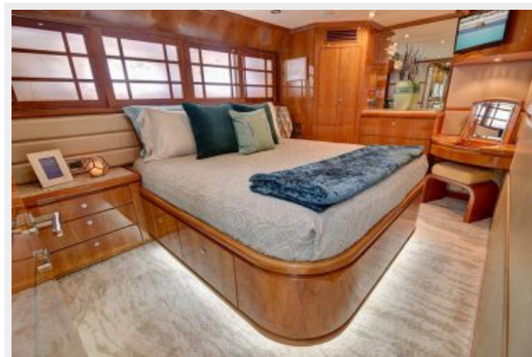
large - 47