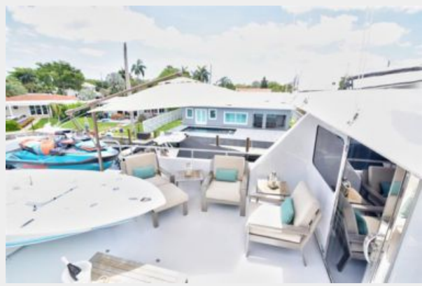
large - 37