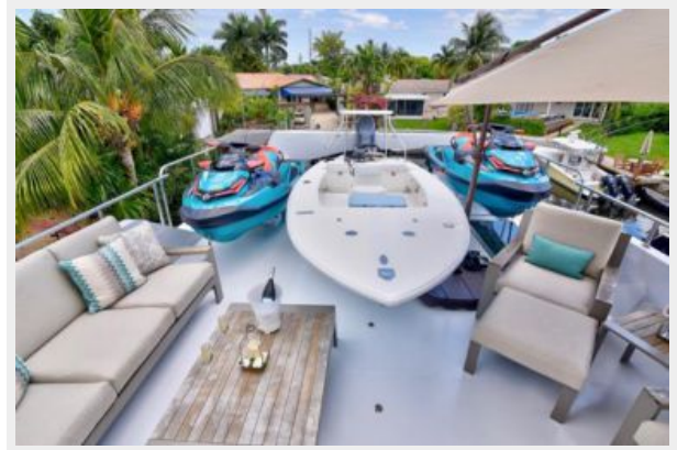
large - 38