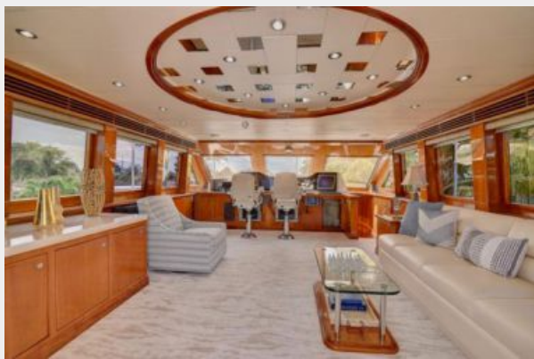
large - 68