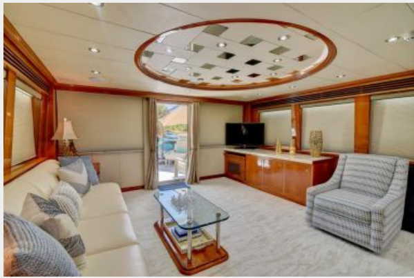
large - 31