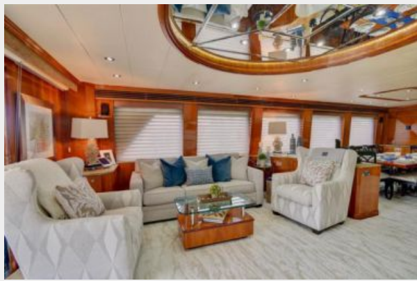
large - 9