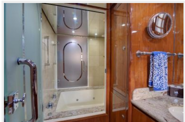
large - 56