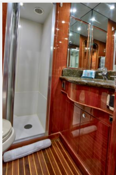
large - 61