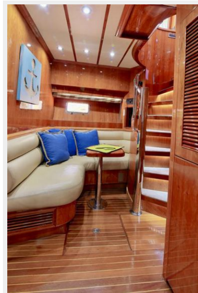
large - 62