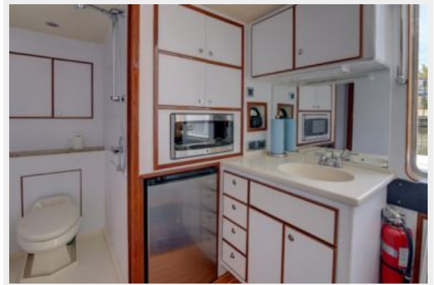
large - 73