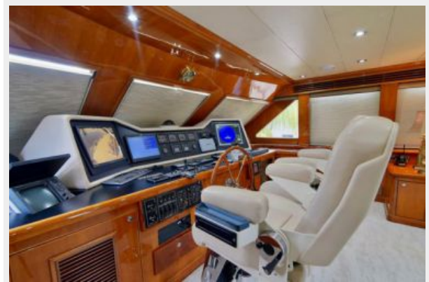
large - 27