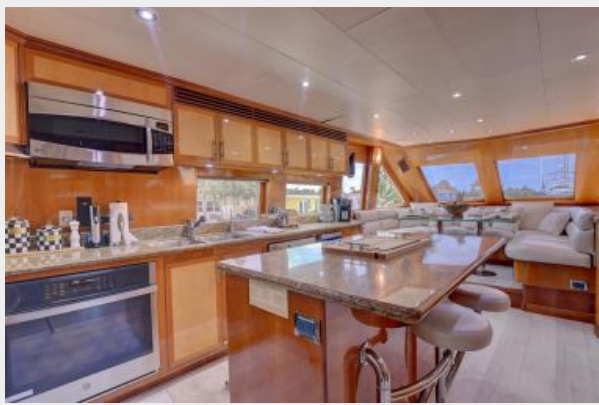
large - 67