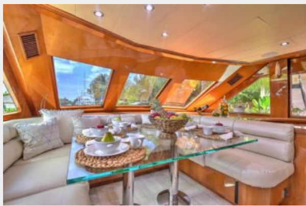
large - 18