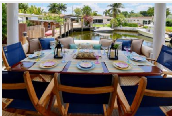
large - 7