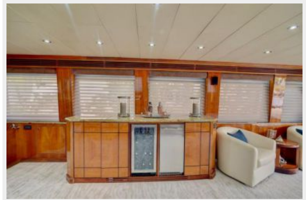
large - 13