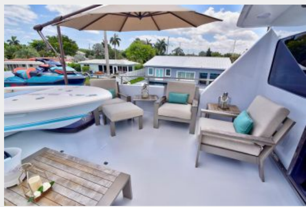
large - 39