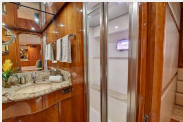
large - 50