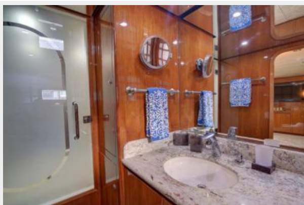
large - 55