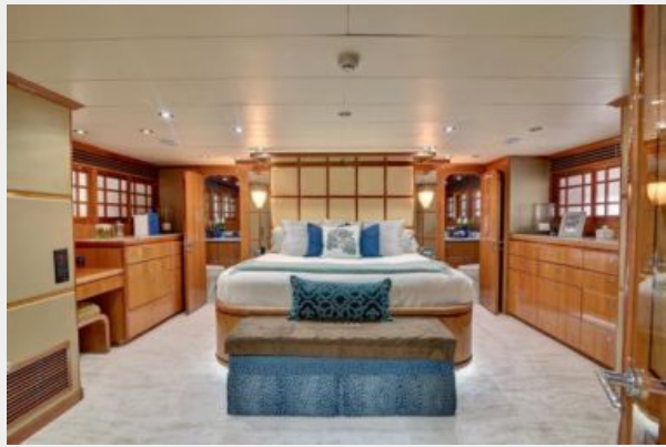
large - 52