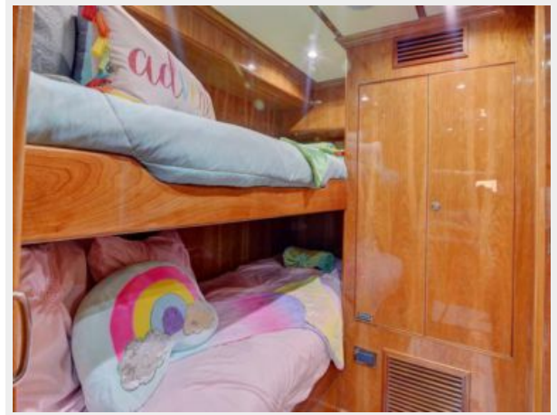
large - 60