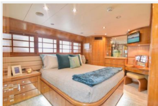
large - 48