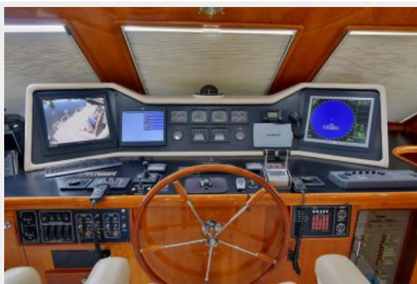
large - 29