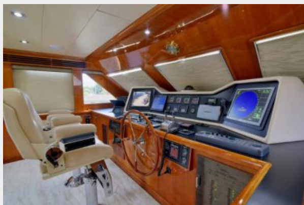
large - 26