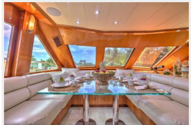
large - 17