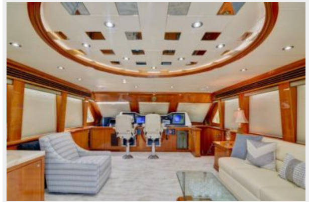
large - 32