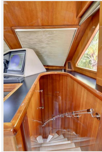
large - 25