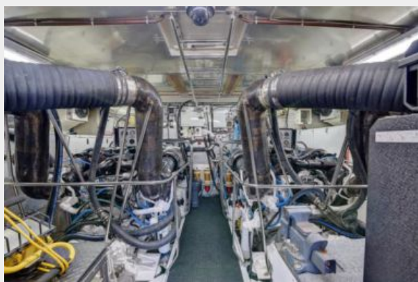
large - 69