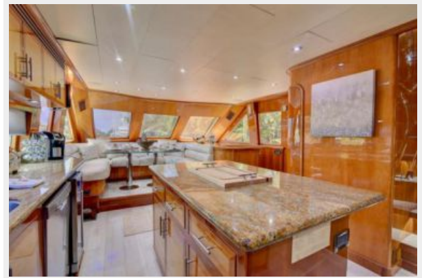
large - 16