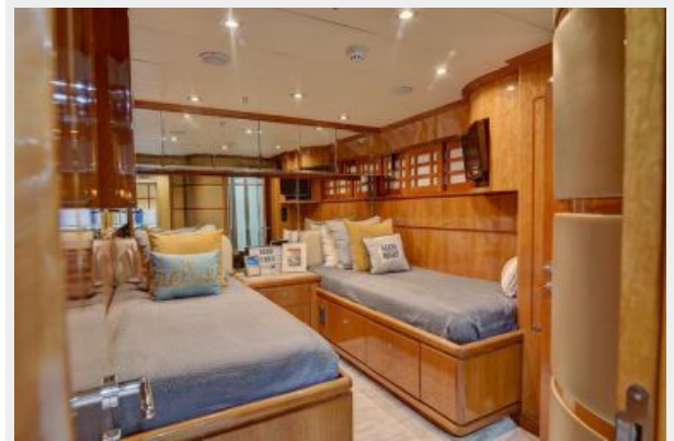
large - 43