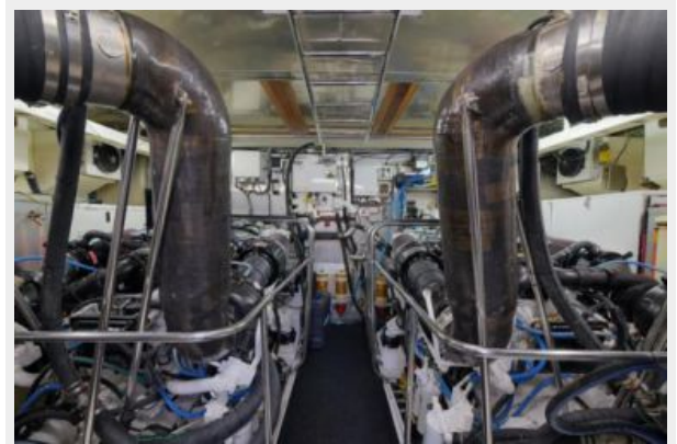
large - 70