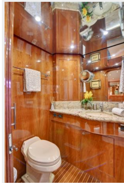
large - 51