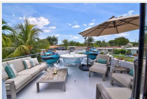
large - 41