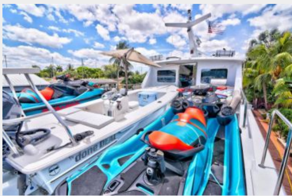
large - 35