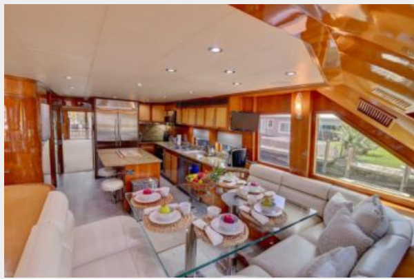
large - 20