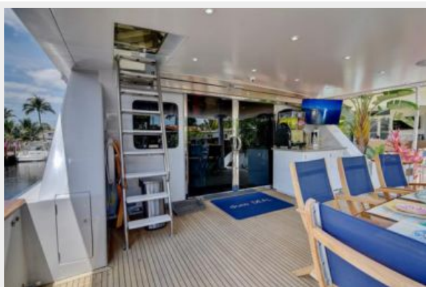
large - 5