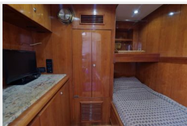
large - 72