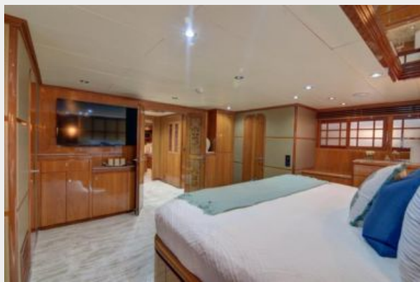
large - 53