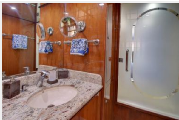
large - 57