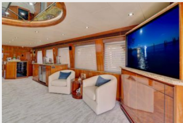
large - 11