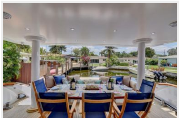
large - 6