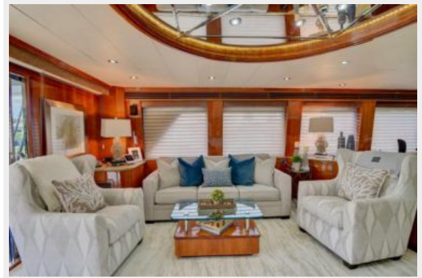
large - 10