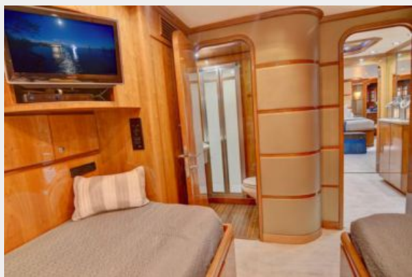
large - 44