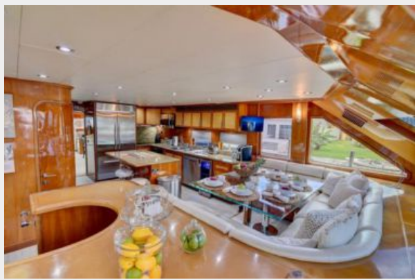
large - 22