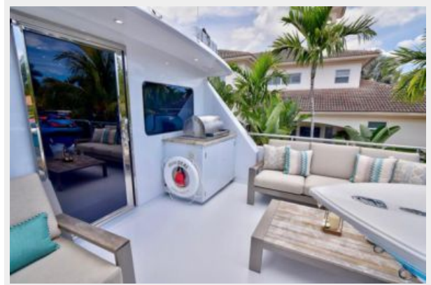
large - 40