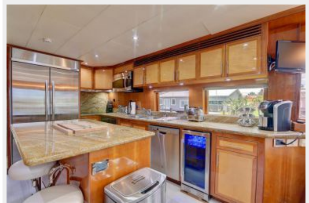
large - 23