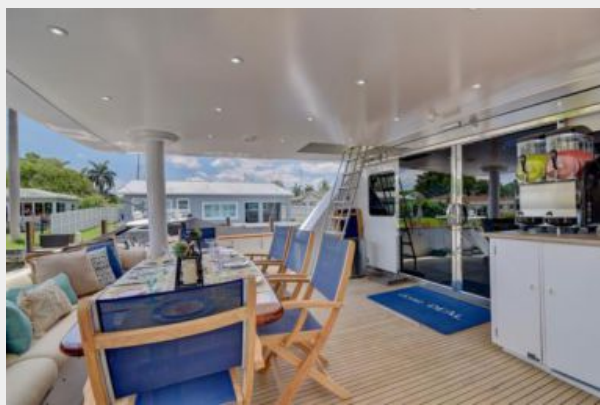
large - 2