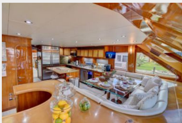
large - 22