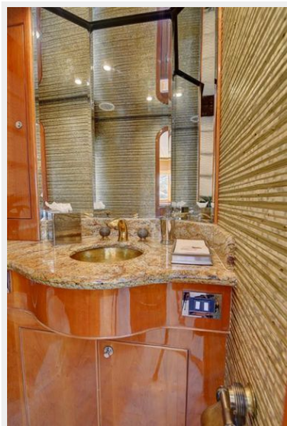
large - 66