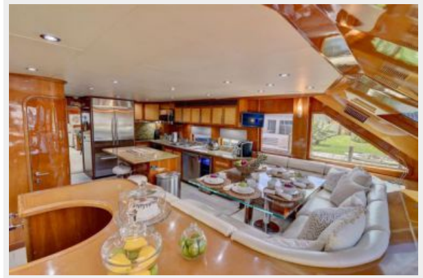
large - 21