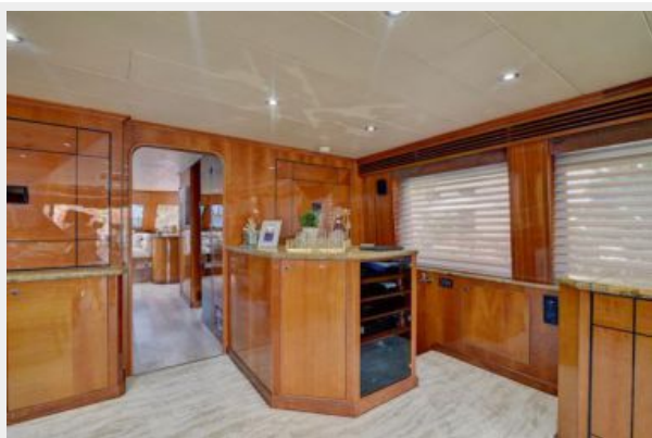
large - 12