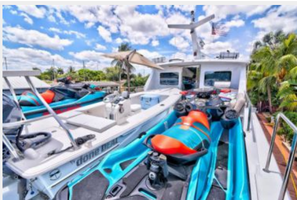
large - 35