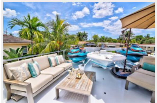
large - 34