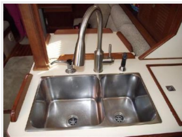
SS sink/new faucet