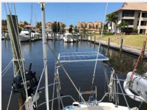
2X100 watt solar panels