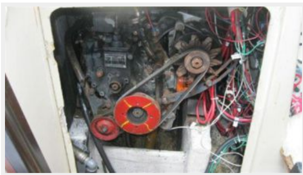
Yanmar 22HP diesel