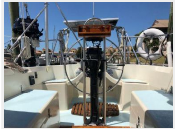
Garmin Radar Dome - 2016