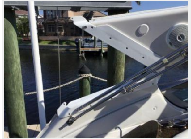
Hinged Arch Open