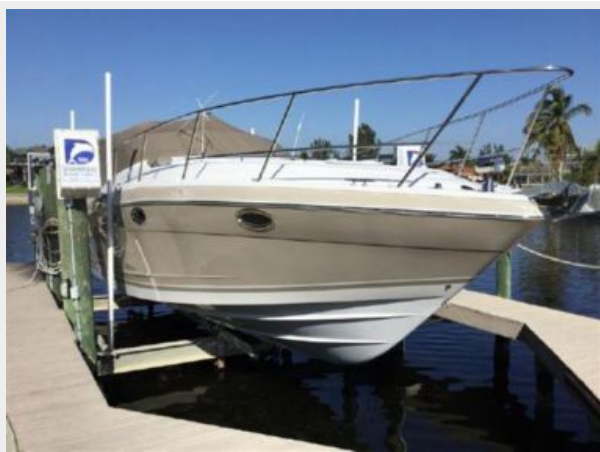
Stored On A Lift