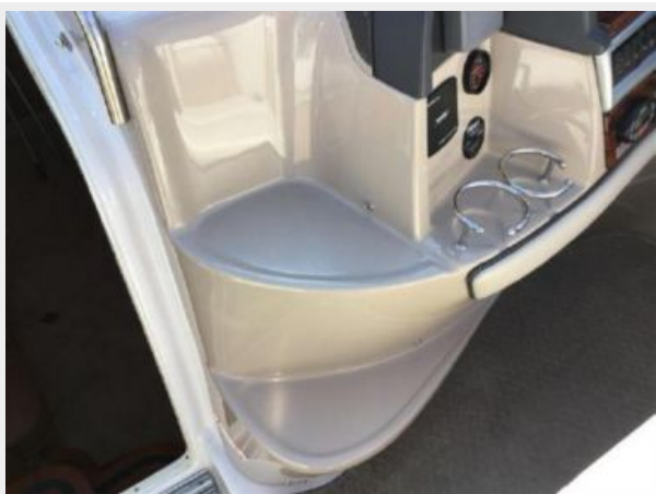
Walk Thru Windshield