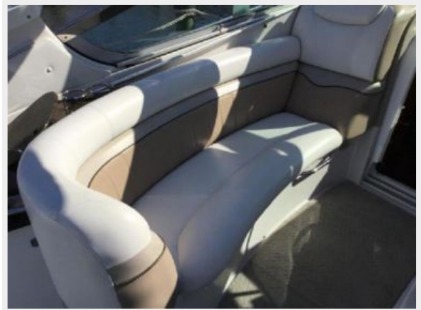
Port Side Lounger