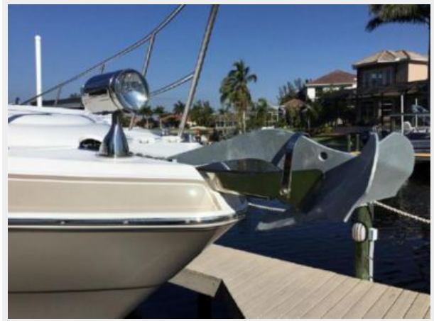
Anchor - Remote Bow Light