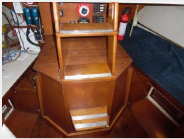
Engine Cover w Stairs to The Cockpit