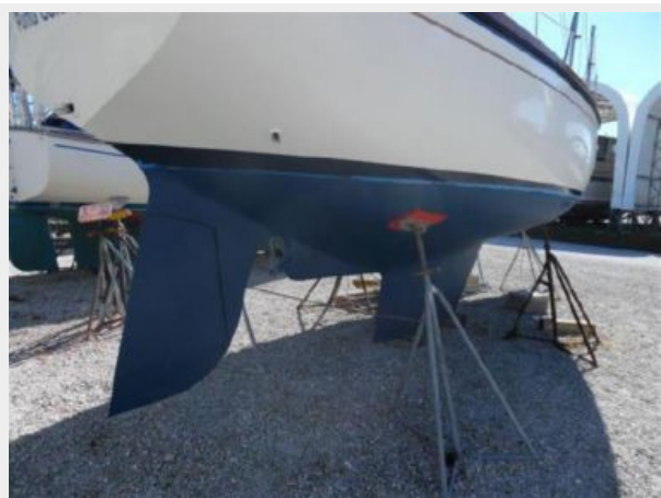
Below Water Line Starboard