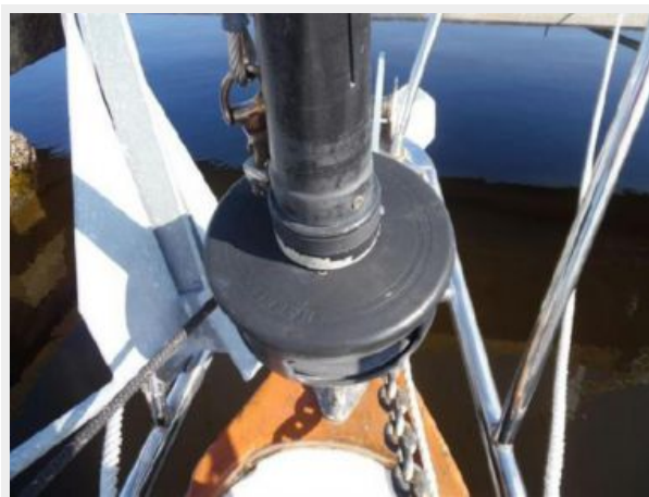
Harken Roller Furling