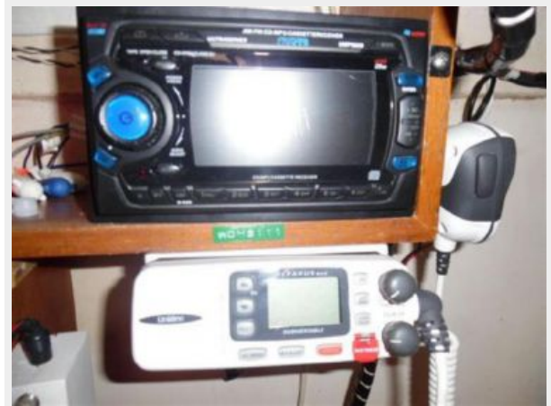
Stereo System and VHF Radio (Stereo has Interior and Cockpit Speakers)