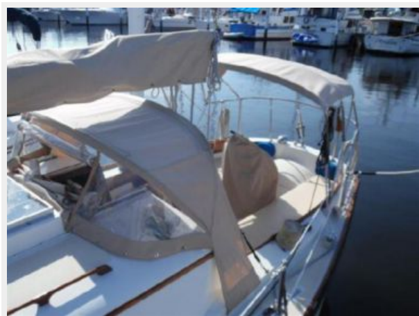
Cockpit and Covers