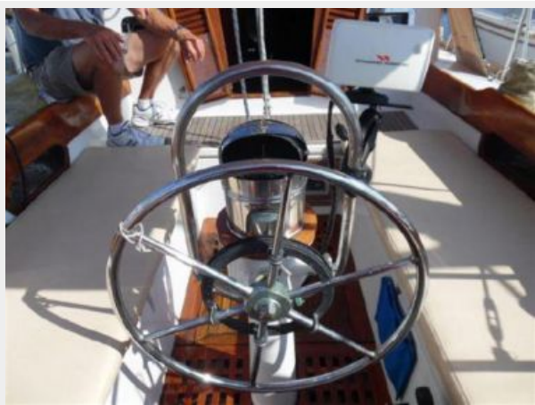
Stainless Steel Steering Wheel