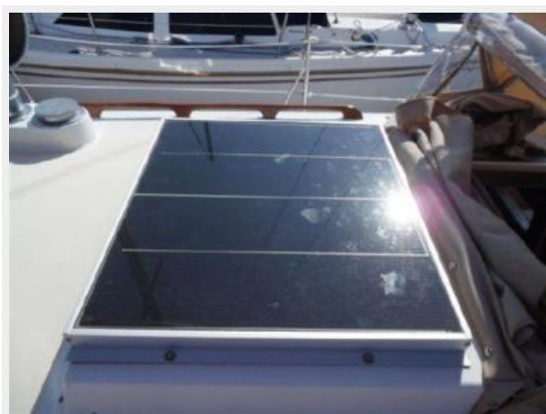
750 Watt Solar Panel