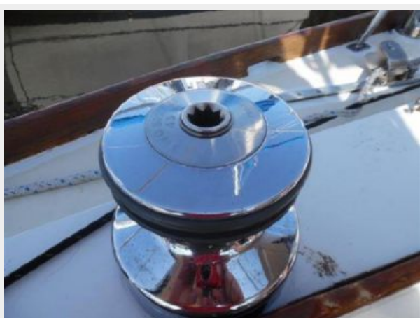
Lewmar 43 Winch Port