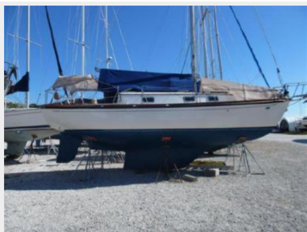
On The Hard Starboard Side