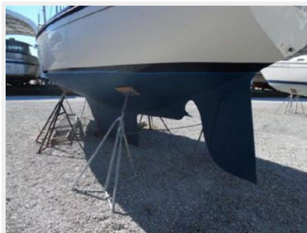
Below Water Line Port