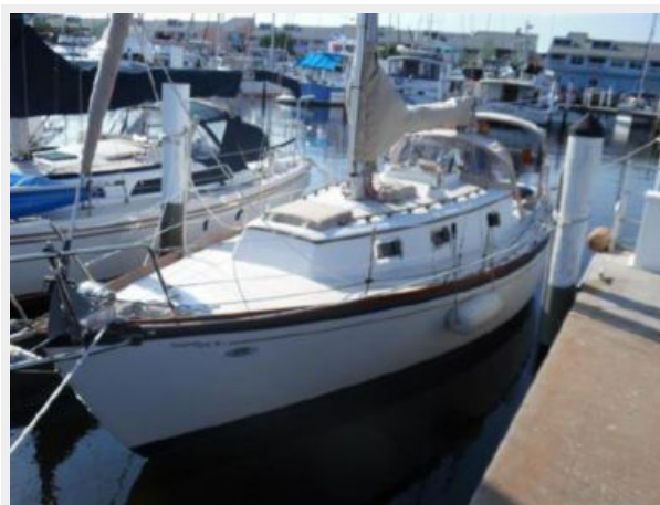
At Dock Port