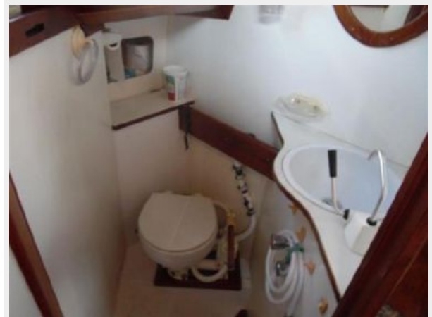
Enclosed Head w Flushing Toilet and Fresh Water Shower