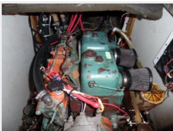
Volvo MD11C Diesel