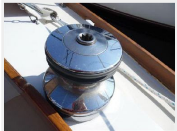
Lewmar 43 Winch Starboard