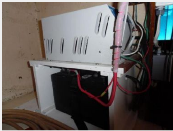
2000 Watt Inverter