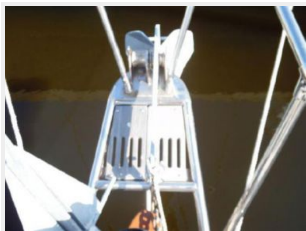
Custom Stainless Steel Bow Pulpit