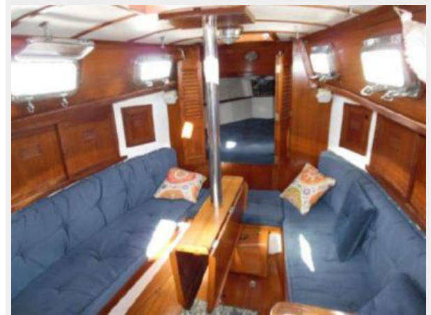
Interior Forward From Mid Ship