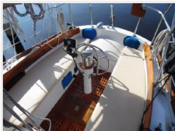
Cockpit w Cockpit Cushions