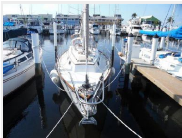
At Dock Bow