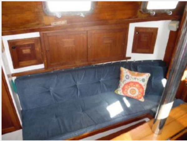
Seating Port w Ample Storage Above