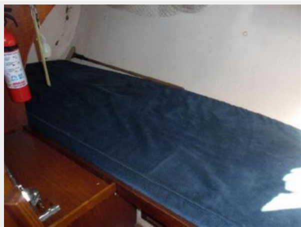
3/4 Berth Port