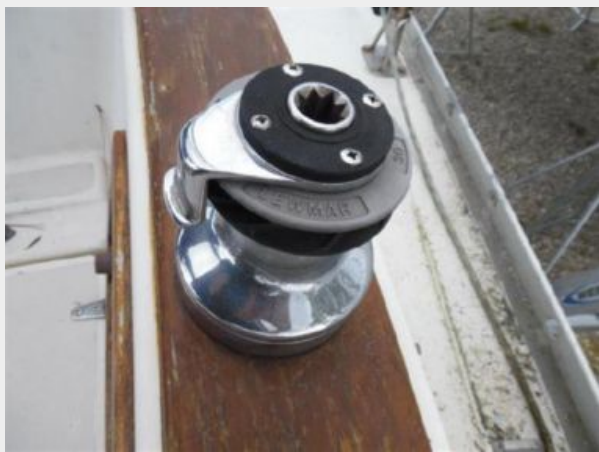
Lewmar Winch Port