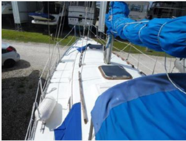
Bow Top Side Port