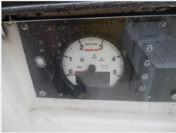
New Yanmar Instrumentation