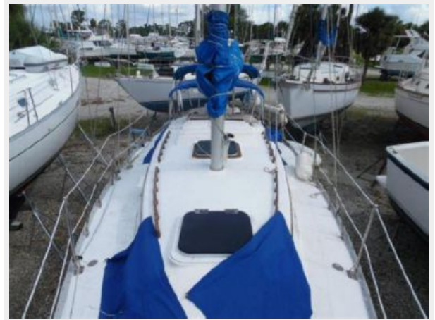
View Aft From Bow