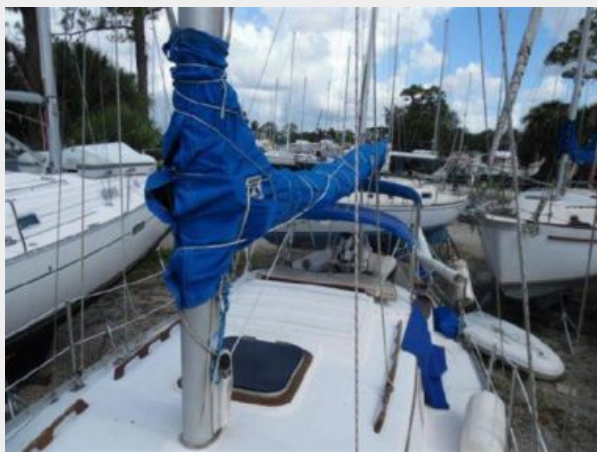
View Aft From Mid Ship