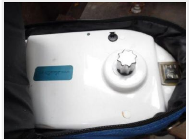
Cordless Power Winch