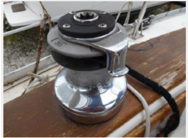
Lewmar Winch Starboard