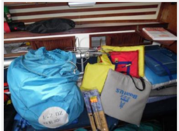
Sail Bag , Flotation