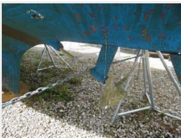
Prop and Shaft