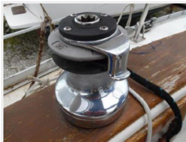
Lewmar Winch Starboard