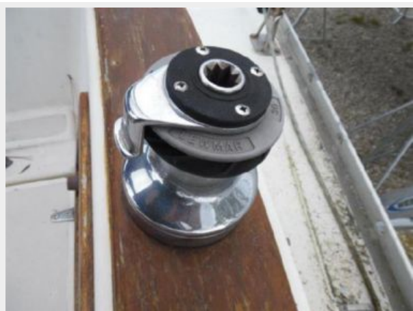
Lewmar Winch Port