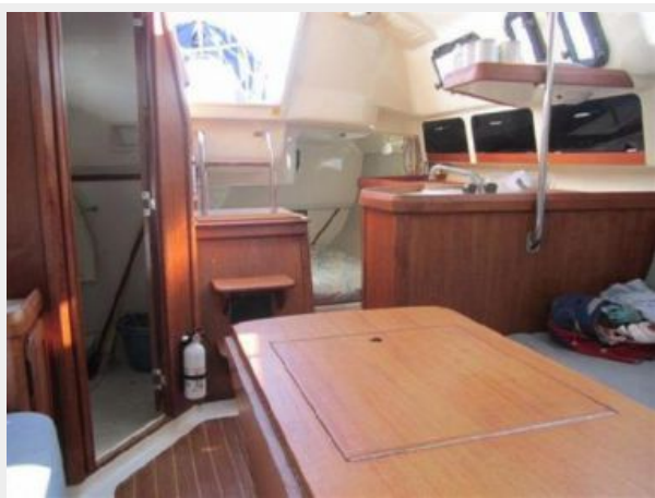
MAIN CABIN LOOKING AFT