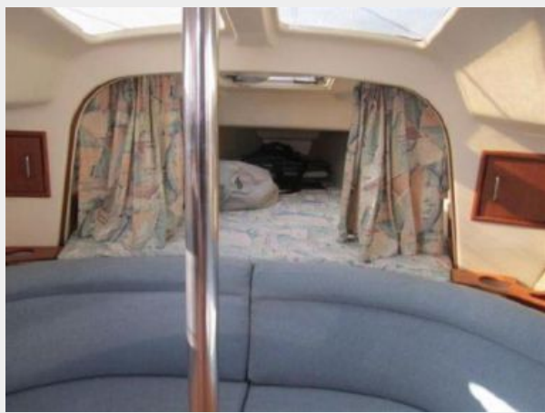
LARGE DOUBLE BERTH FWD