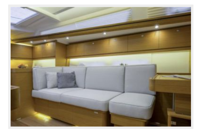
Dufour 520 GL Stb settee