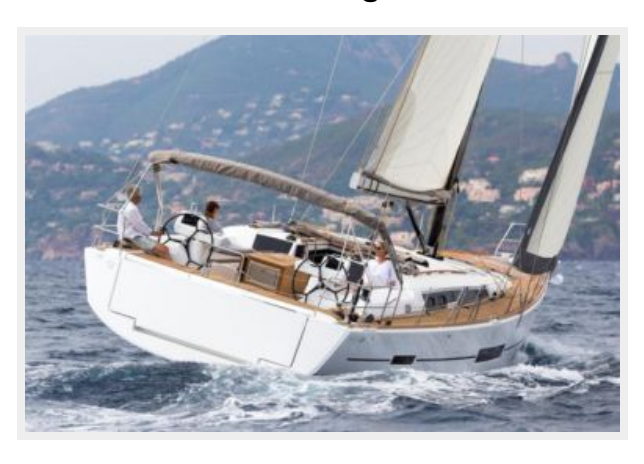
Dufour 520 GL sailing transom view