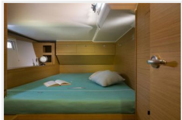
Dufour 520 GL stb side aft cabin