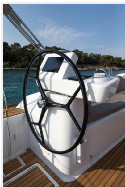
Dufour 520 GL helm