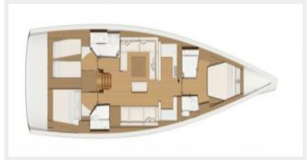
Dufour 520 GL 3 Cabin 3 Head