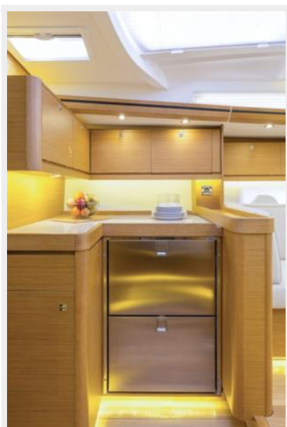
Dufour 520 GL drawer fridge