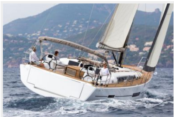
Dufour 520 GL sailing transom view