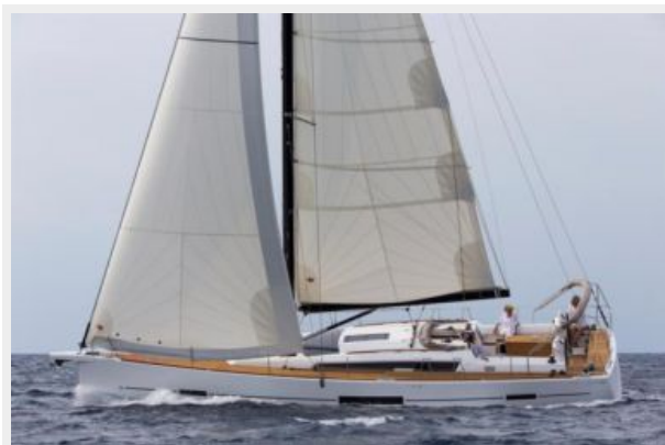
Dufour 520 GL Sailing