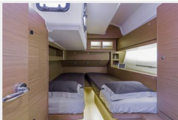
Dufour 520 GL port side aft cabin