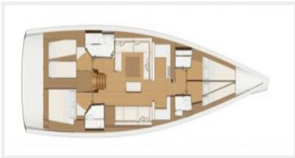
Dufour 520 GL 4 Cabin 3 Head