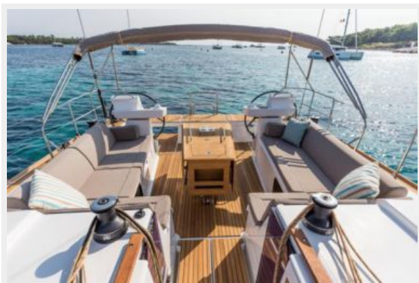
Dufour 520 GL cockpit