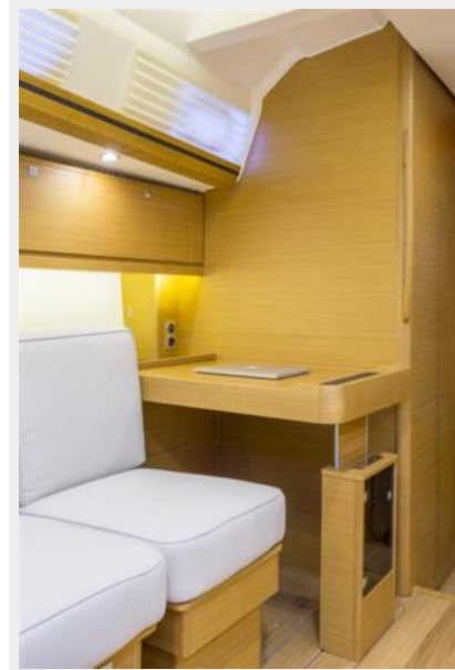
Dufour 520 GL Nav Station