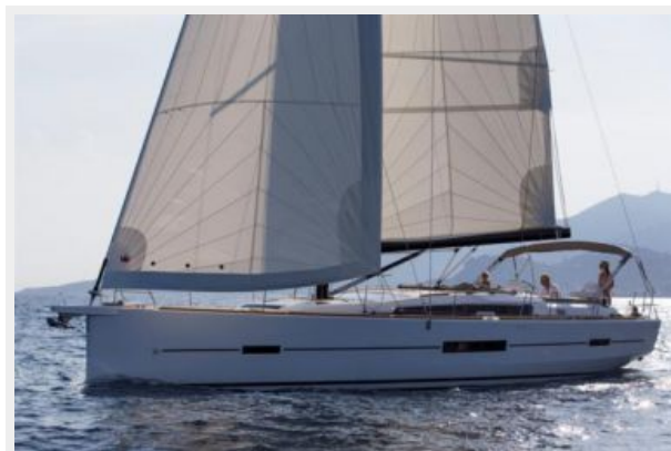
Dufour 520 GL sailing