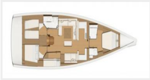
Dufour 520 GL 3 Cabin 2 Head