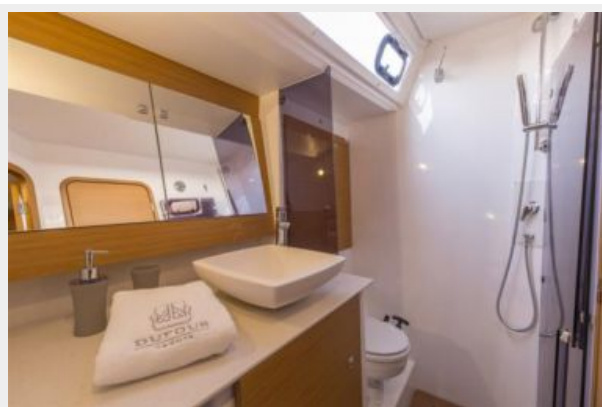
Dufour 520 GL head