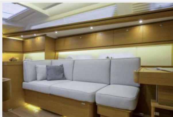
Dufour 520 GL Stb settee