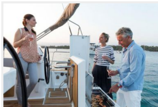
Dufour 520 GL grill