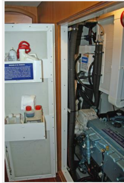
Engine Room Door