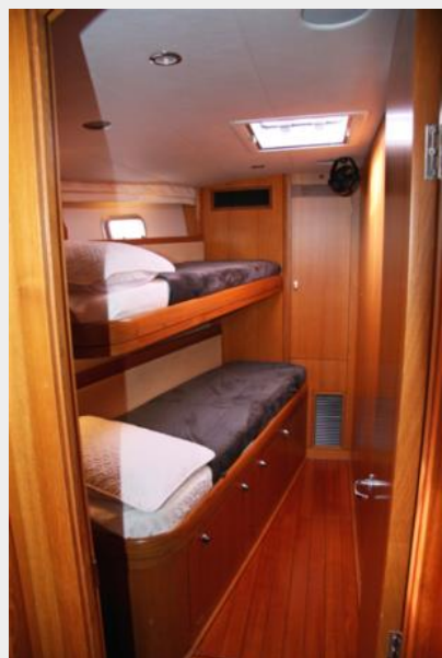
Port Guest Cabin