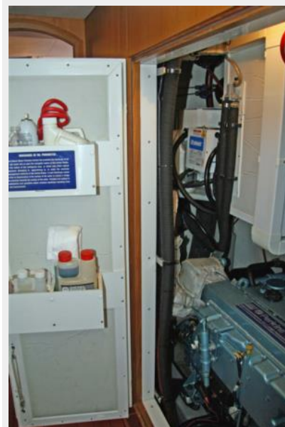
Engine Room Door