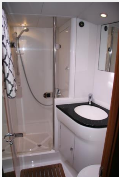
Stbd. Guest Head