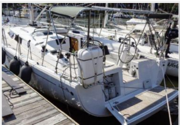
At the Pier...