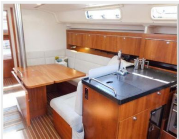
Dinette - to Starboard