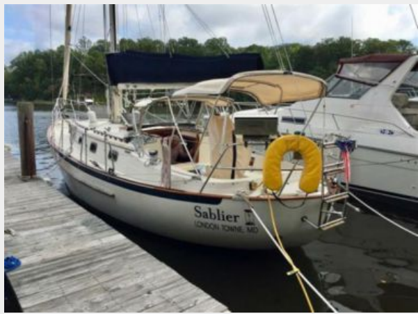
Sablier Pacific Seacraft 37