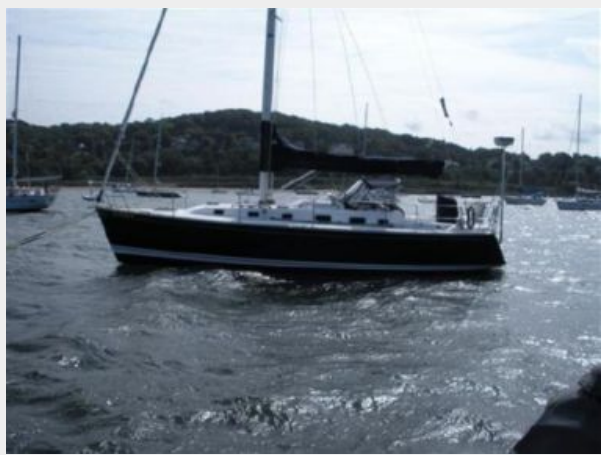
Tartan 3700 - Mooring