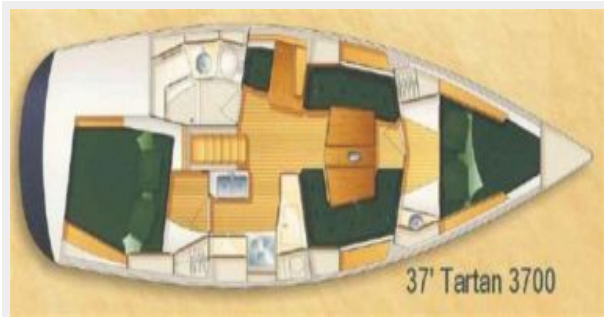
Tartan 3700 Layout