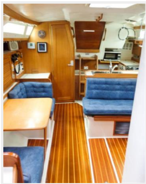
Saloon - Looking Aft