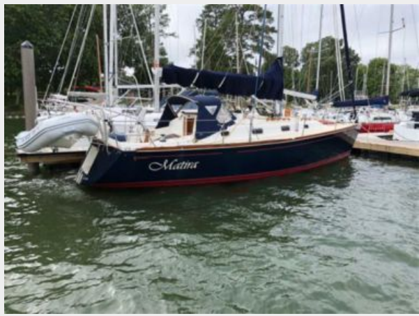
2006 Tartan 3400 Matira