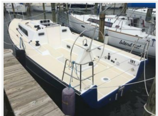
Tartan 101 Deck