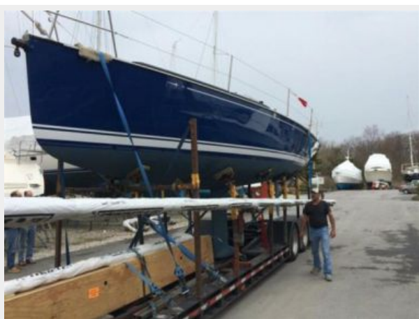
Beautiful Blue Hull!