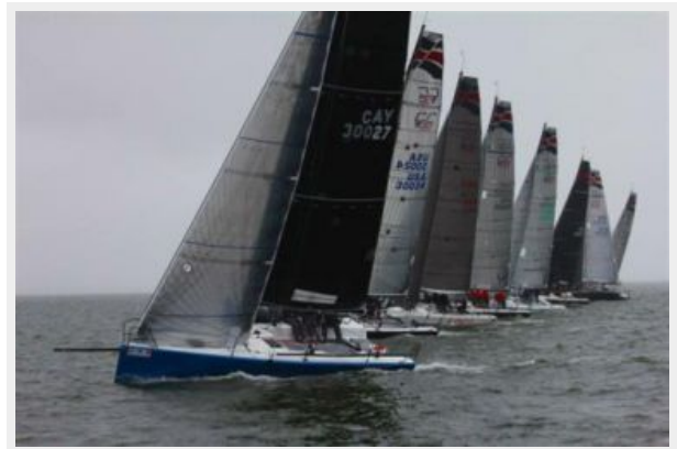
C&C 30 One Design Start