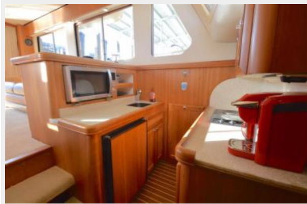
34 Mainship Trawler