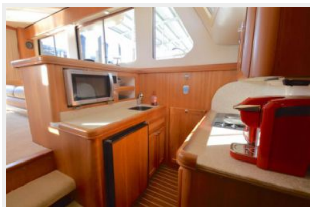
34 Mainship Trawler