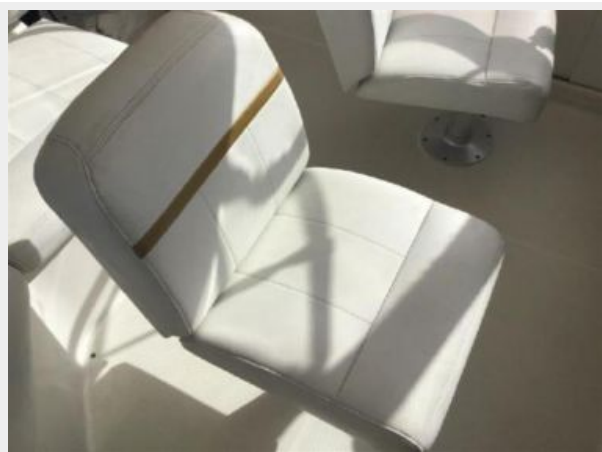
Captain's Helm Seat