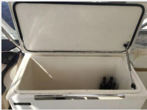
Helm Frigidaire Freezer