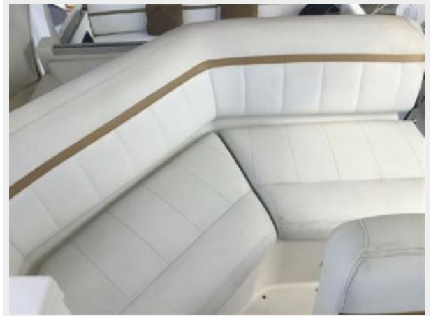
Helm Aft Seat