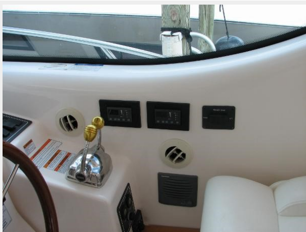
Helm Air Conditioning Controls