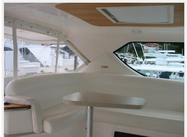
Helm Lounge with Table