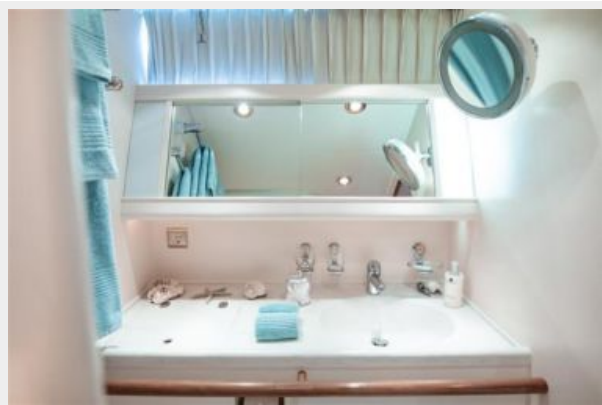
Jongert 2900M SCARENA