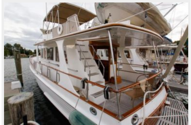
Sandalwood - 31_DSC2808CC Fox -adj_1