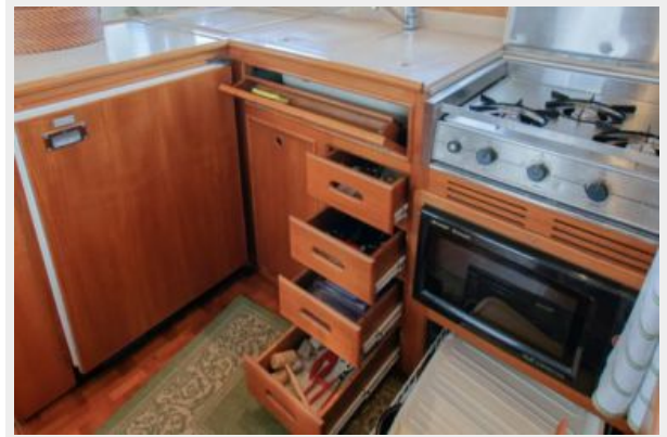
Sandalwood - 14_DSC2691CC Fox -adj_1