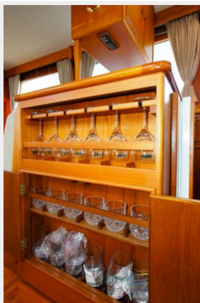
Sandalwood - 15_DSC2704CC Fox -adj_1