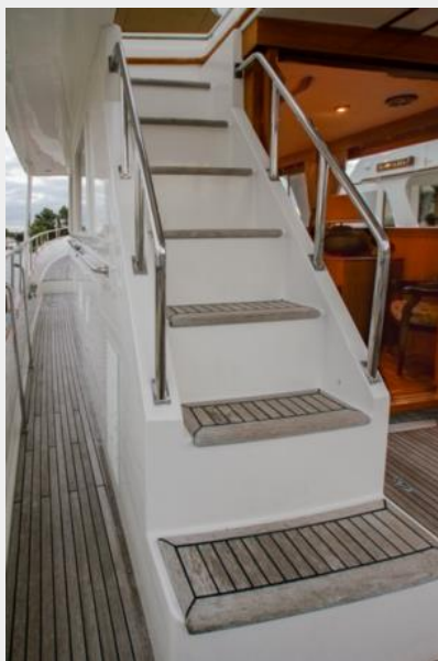
Sandalwood - 39_DSC2815CC Fox -adj_1