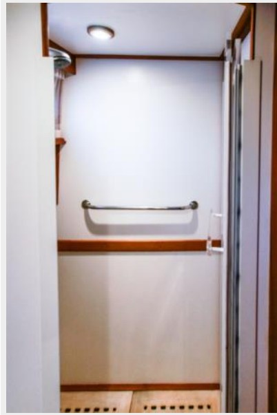
Sandalwood - 27_DSC2781CC Fox -adj_1