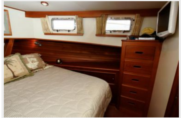
Sandalwood - 26_DSC2785CC Fox -adj_1