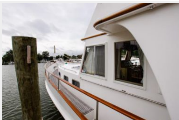
Sandalwood - 33_DSC2881CC Fox -adj_1