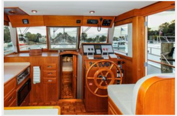
Sandalwood - 18_DSC2730CC Fox -adj_1