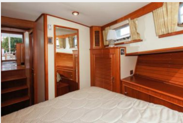
Sandalwood - 25_DSC2758CC Fox -adj_1