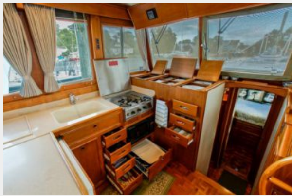
Sandalwood - 13_DSC2689CC Fox -adj_1