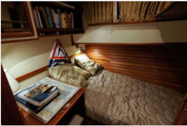
Sandalwood - 21_DSC2844CC Fox -adj_1