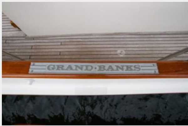
Sandalwood - 37_DSC2802CC Fox -adj_1