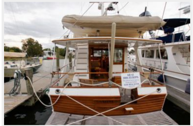
Sandalwood - 29_DSC2810CC Fox -adj_1