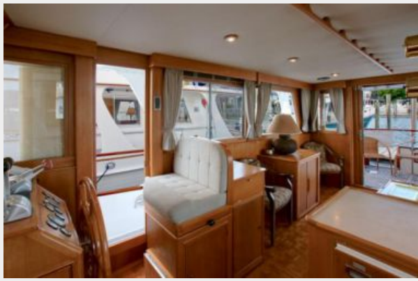
Sandalwood - 17_DSC2681-EditCC Fox - adj_1