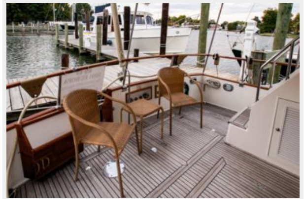
Sandalwood - 38_DSC2812CC Fox -adj_1