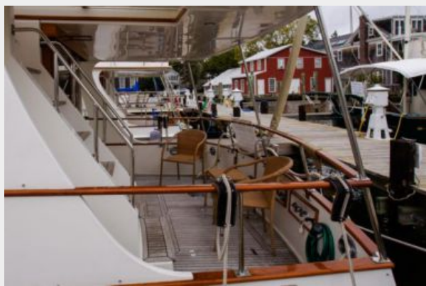
Sandalwood - 30_DSC2884CC Fox -adj_1