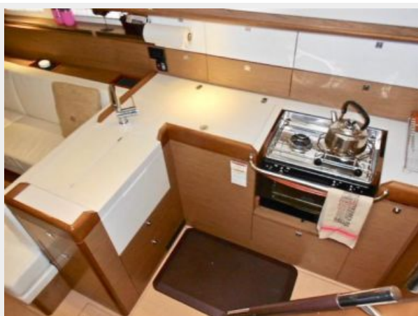
Clean lines and loads of storage in the galley