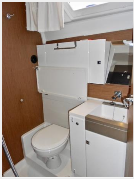
Countertop extension folded up