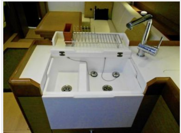
The sink cover folds and slides back to open up the sinks and provide a place for sponges and soap while you wash