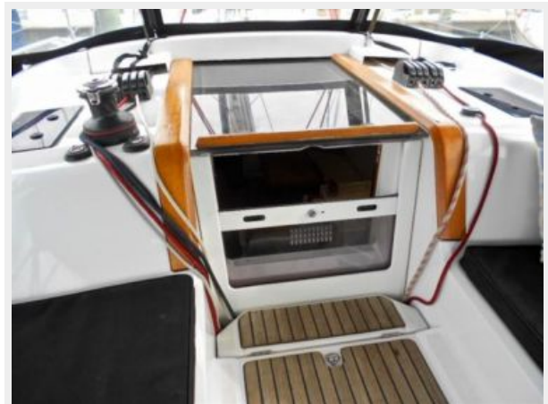
Line tails stow away beneath the self-stowing companionway boards