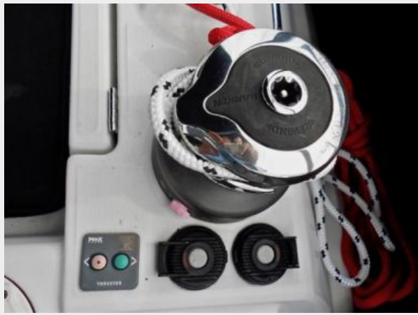
Harken Rewind two-speed reversing electric winches and a bow thruster make things easy