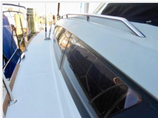
Clean, wide side decks keep things safe