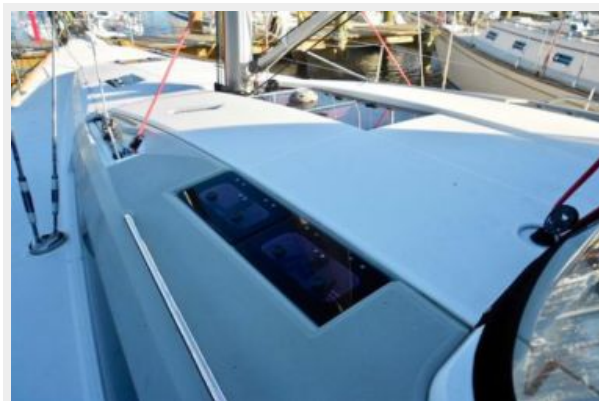
Housetop deck is sleek and unobstructed