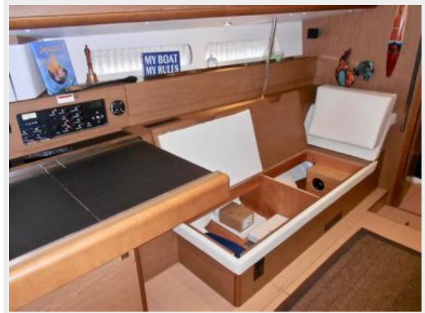
Loads of storage beneath and behind the settees