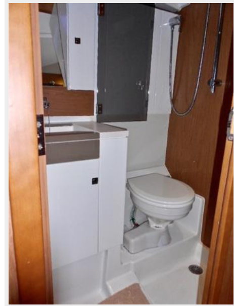
Fresh water flush electric heads