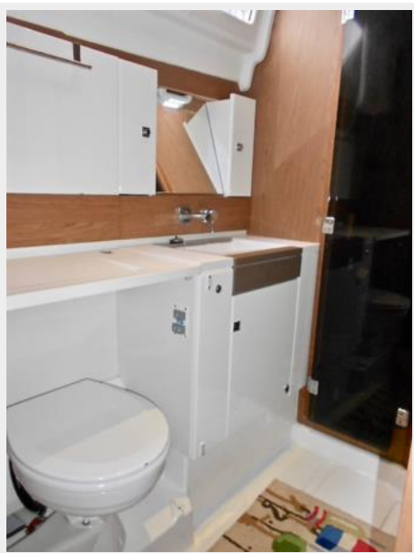
Aft head is accessible from the aft cabin or saloon. Note the countertop extension over the head. Workbench?