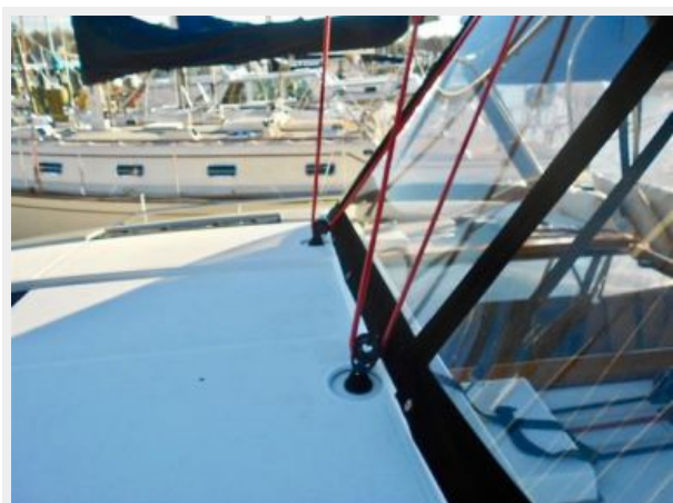
German main sheeting