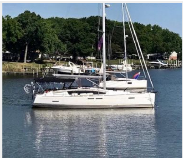
"SUNDAY KINDA LOVE" at anchor