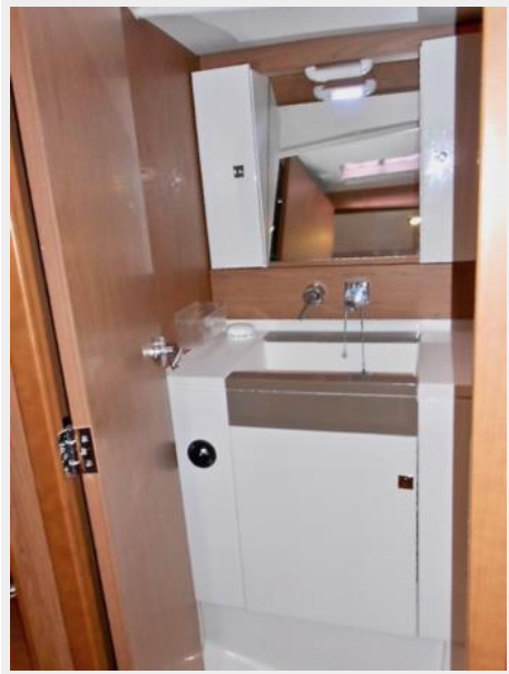
Looking into the forward ensuite head