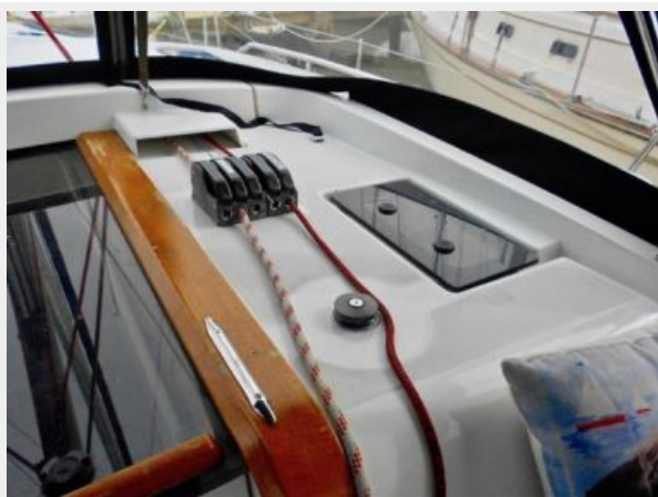
Lines on starboard go around the Spinlock block and over to the electric winch