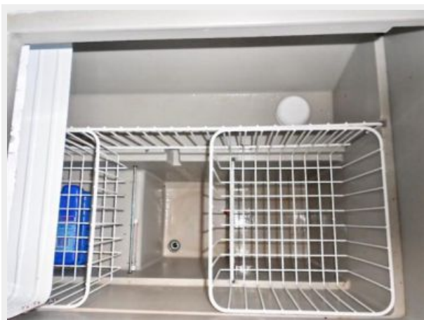
Sliding rack organizers and a bin freezer to the left