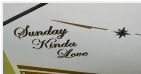
SUNDAY KINDA LOVE