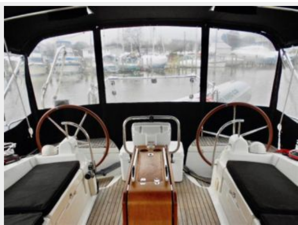
Great cockpit and room to entertain