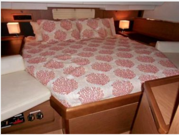
Centerline king berth in the master stateroom aft; note the leather nightstand spaces