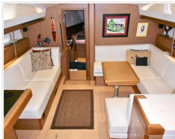
Fantastic saloon area