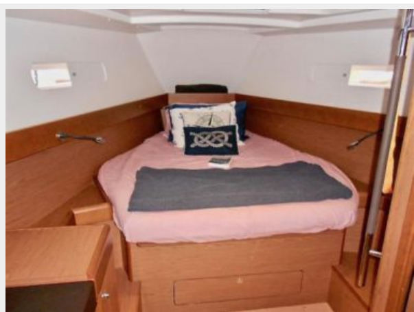
Centerline queen forward