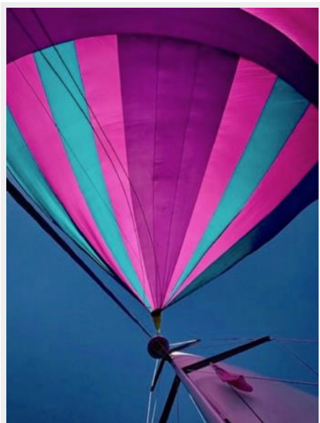
Flying her chute