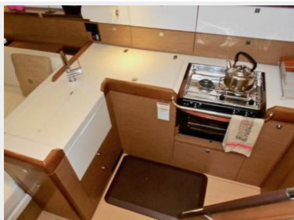
Modern galley with clean lines