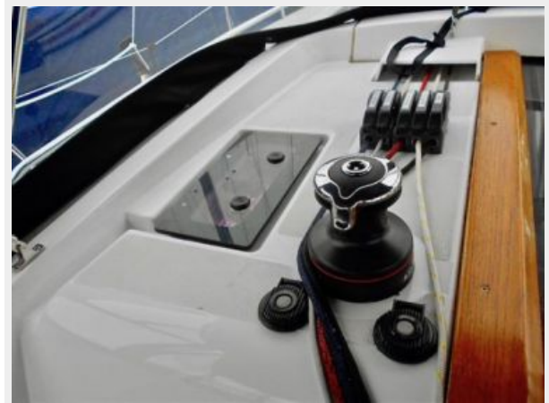
Electric two-speed halyard winch on port