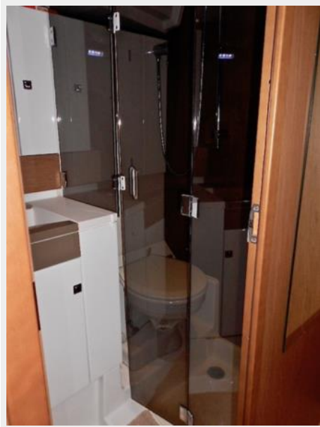
Folding Plexiglass panels swing easily to separate the shower