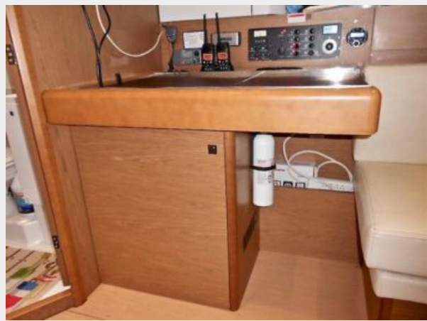
Locker beneath the nav station....