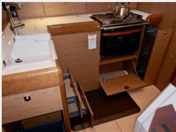
Drawers and bin storage below