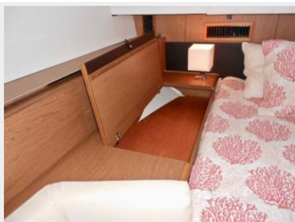
More storage beneath the nightstand spaces on either side