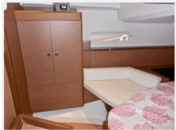
Double hanging lockers on starboard, with nice seating areas on either side