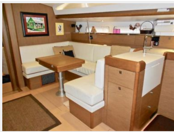
The dinette on starboard with electrically operated table