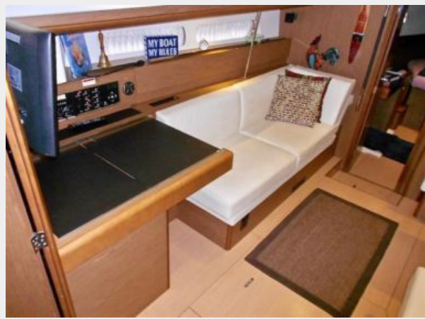
On port, the nav with double leather desktops and settee