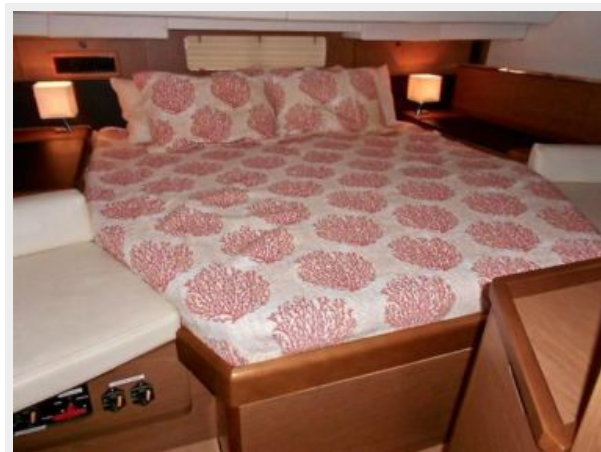
Master king centerline aft