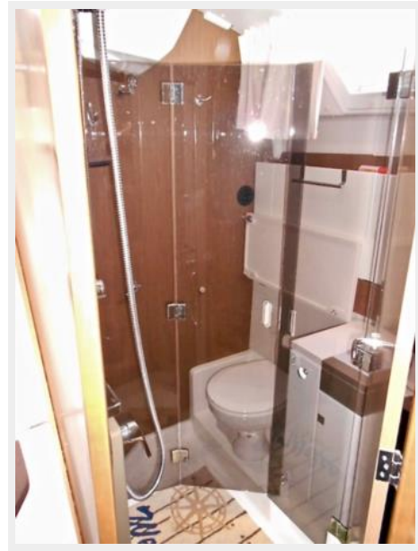
Plexiglass bi-fold panels swing into place for showering