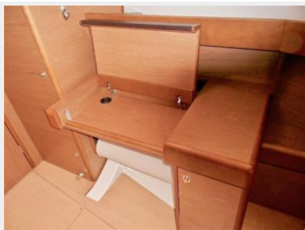
With computer storage beneath the top