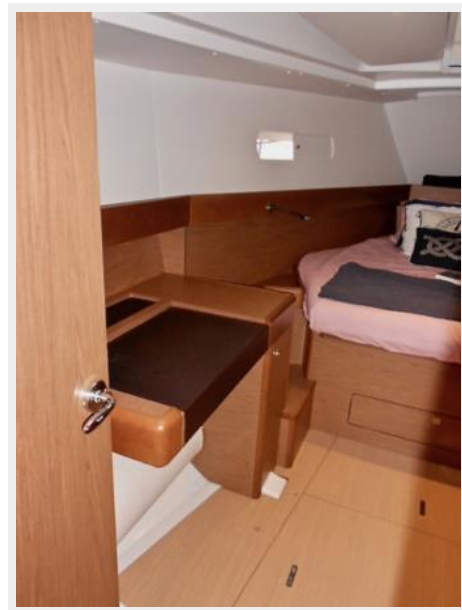
Leather top desk on port in the forward stateroom