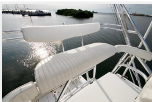
Tower Helm Seating