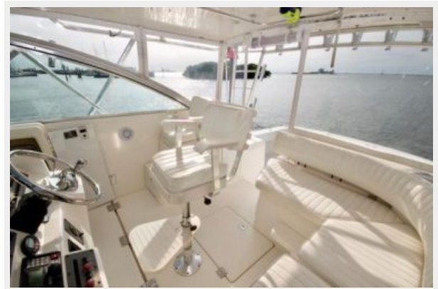
Lower Helm Seating