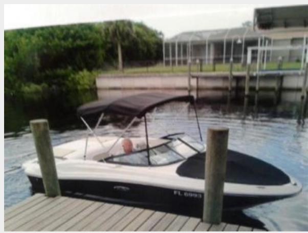
Boat at the Dock