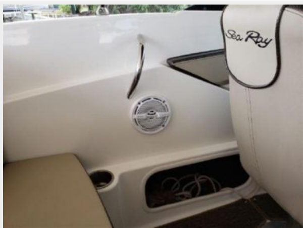
4 Speakers in Boat