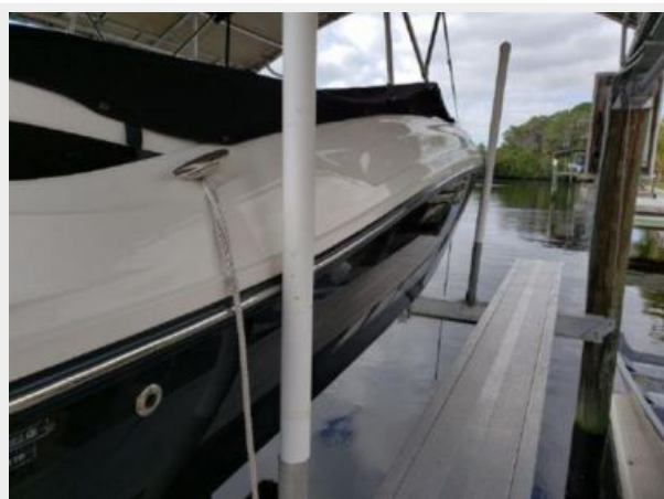
Starboard Hull View