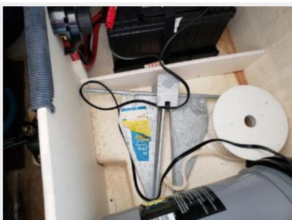
22lb Danforth Anchor - Never Used