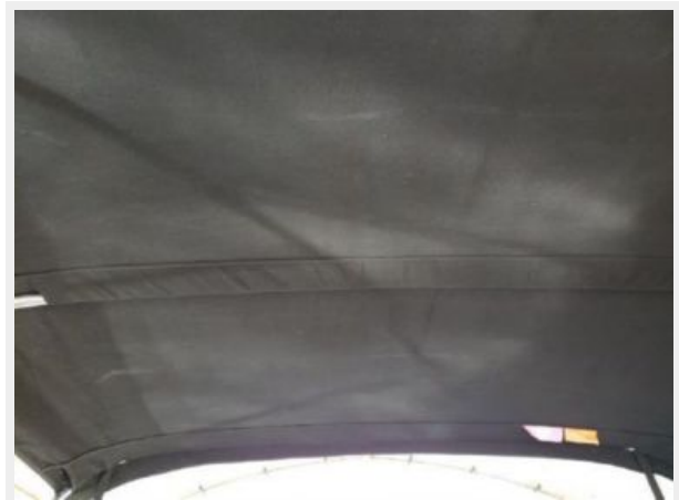
Bimini in Tip-Top Shape