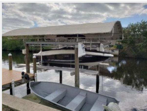
Boat Lift Kept - Cover Over Lift