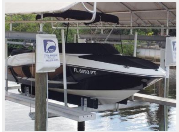
Like New - Full Covers