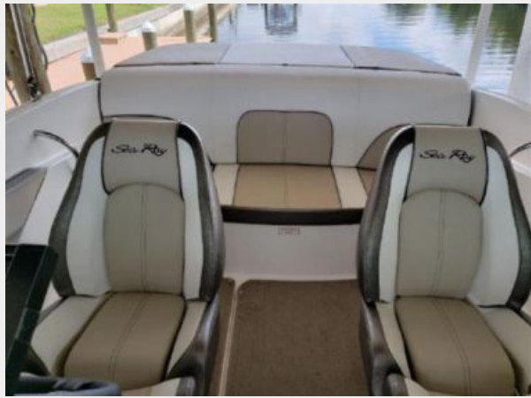
View of Rear Seating / Sunning Platform