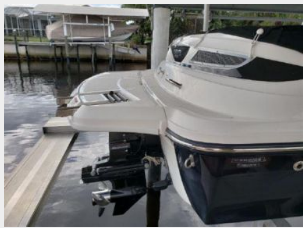
Gelcoat - Like New