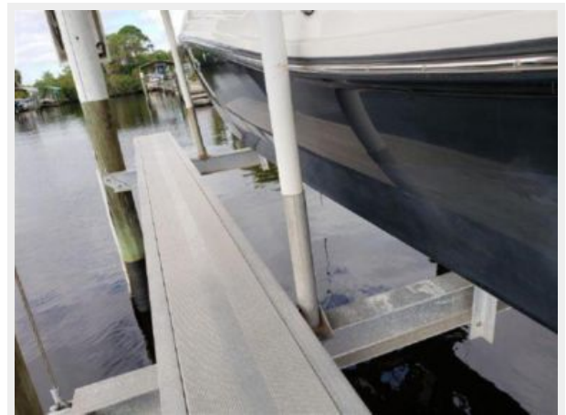
Port Hull View