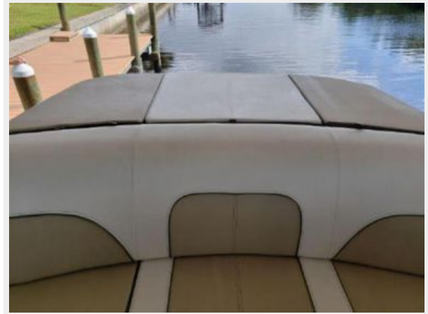
Rear Seat and Deck