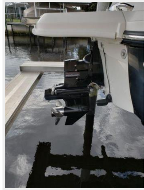
Outdrive - Like New