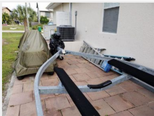
Front of Trailer