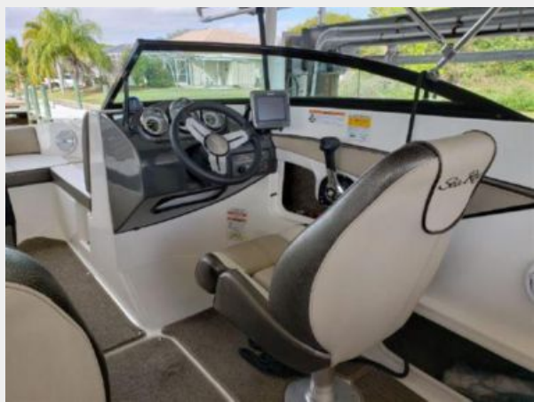
View of Helm Position