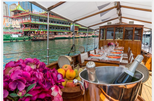
Main Deck Dining for 10 guests