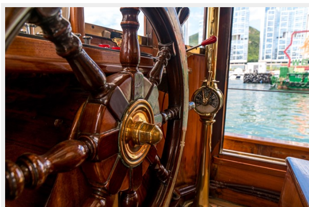
Classic teak wheel and brass throttle