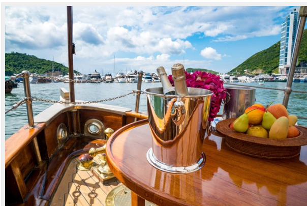
Fore deck serving table