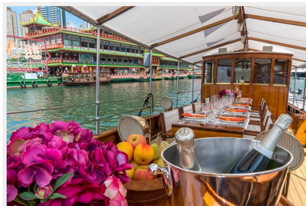
Main Deck Dining for 10 guests