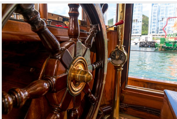
Classic teak wheel and brass throttle