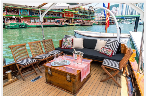
Aft deck lounge