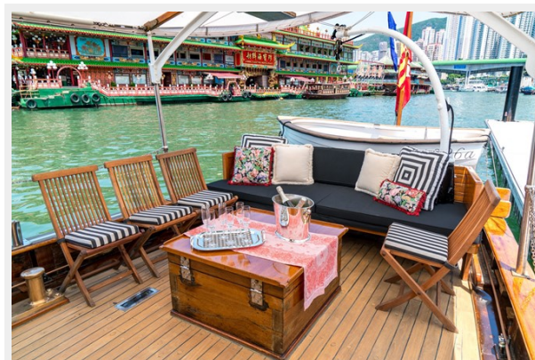
Aft deck lounge