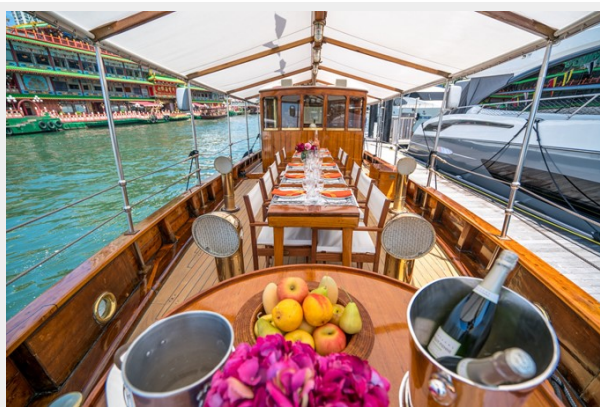
View of wheelhouse