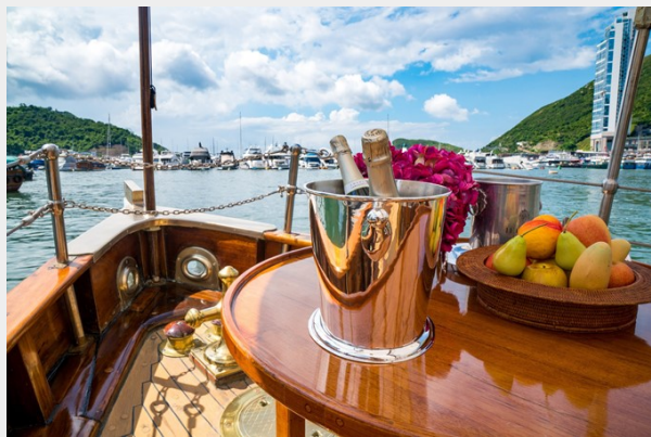
Fore deck serving table