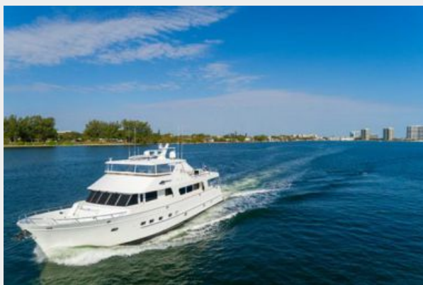
Port Bow Running