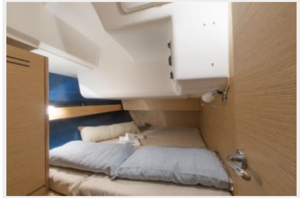
Stb Aft Cabin