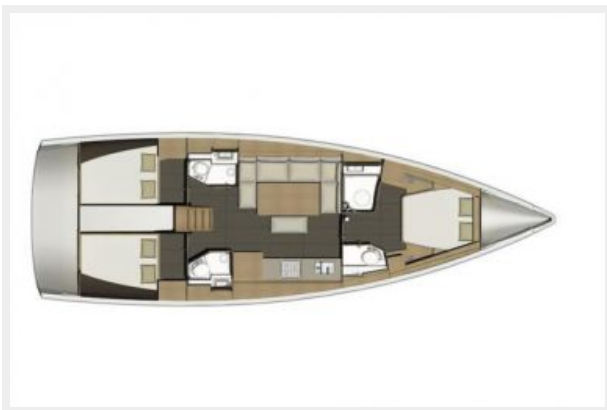
3 Cabin 3 Head