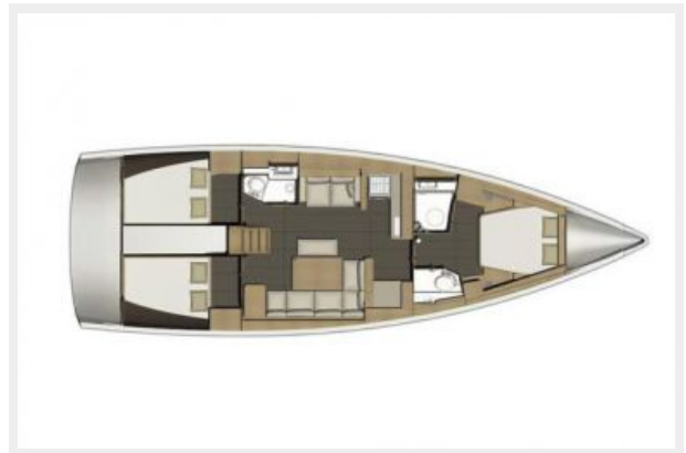
3 Cabin 2 Head