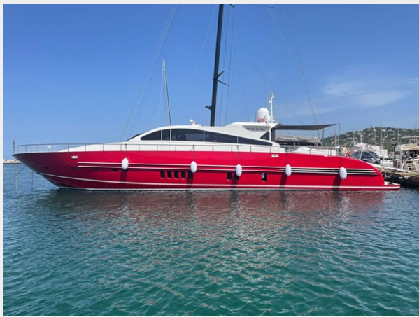
WhatsApp Image 2022-06-24 at 09.11.26 (1)