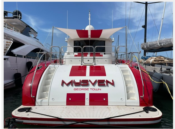
WhatsApp Image 2022-06-24 at 09.11.26