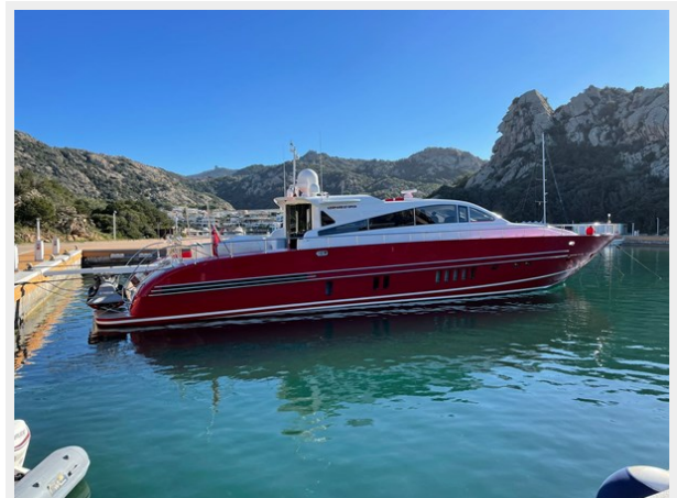
WhatsApp Image 2022-06-24 at 09.11.27 (1)