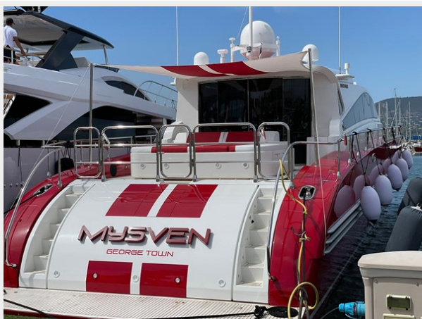
WhatsApp Image 2022-03-29 at 16.48.22