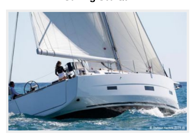
Sailing Stb Qtr