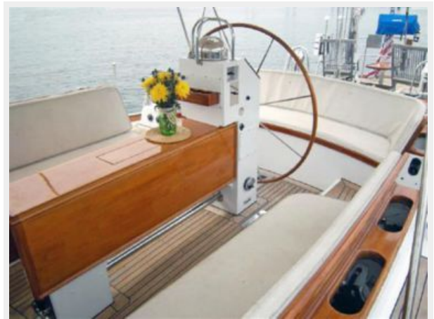
Cockpit, Looking Aft