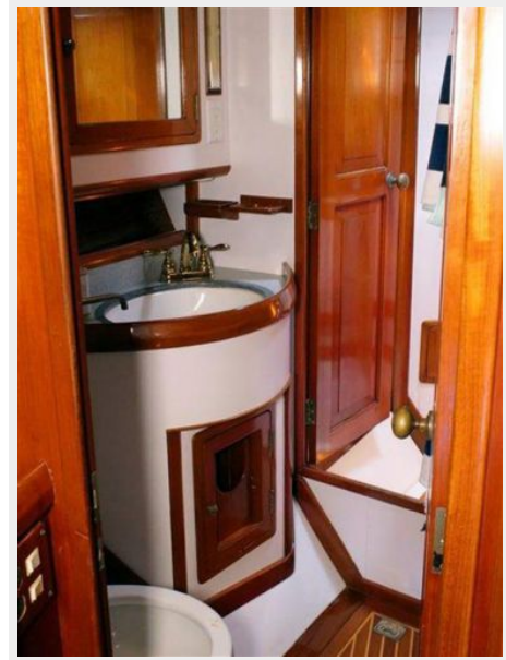
Stbd. Guest Head and Shower