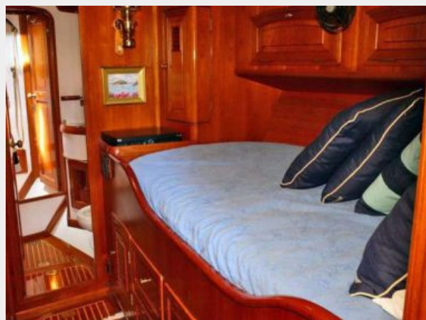
Stbd. Guest Cabin