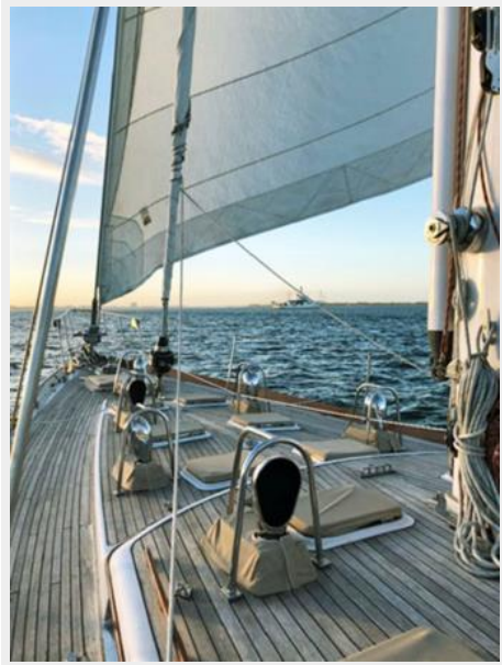
Deck, Looking Fwd.