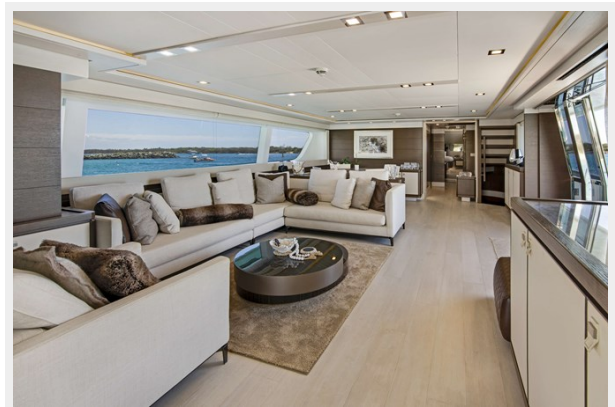
40. Customline 33m Internals (6)