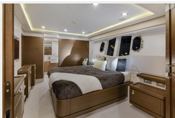
54. Guest Cabin 5 3 (12)