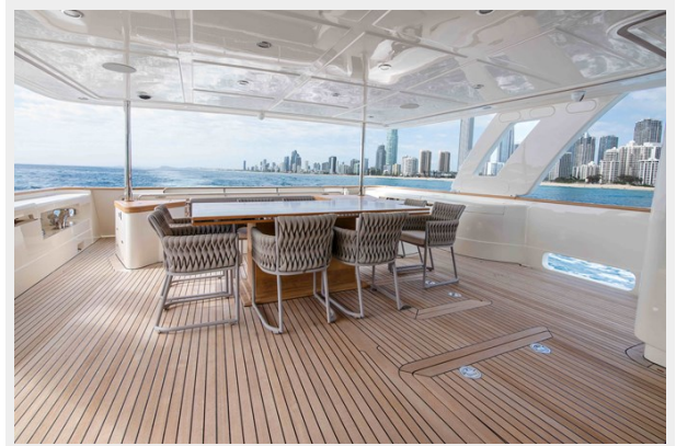
39. Customline 33m