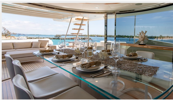
32. Customline 33m photos (4)