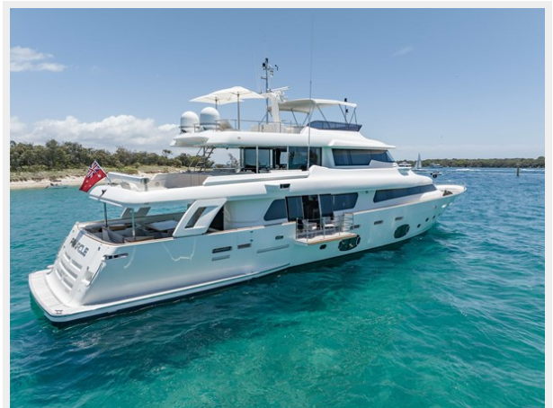
19. Customline 33m photos (66 of 75)