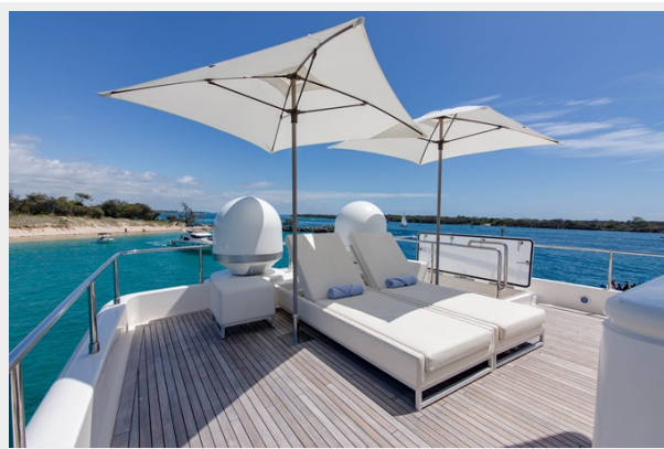
24. Customline 33m photos (60 of 75)