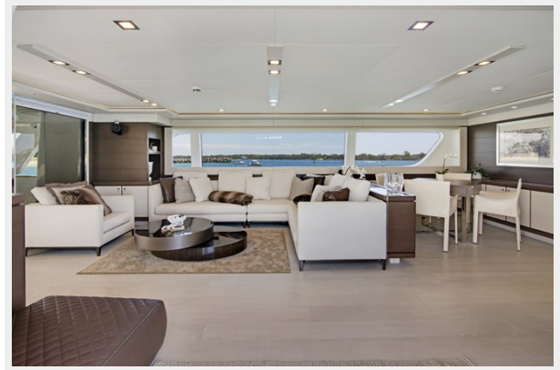
44. Customline 33m Internals (9)