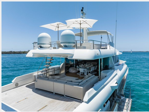
29. Customline 33m photos (62 of 75)