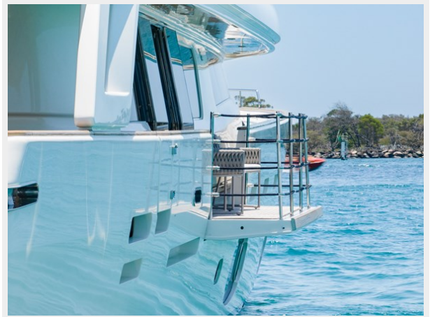
21. Customline 33m photos (68 of 75)