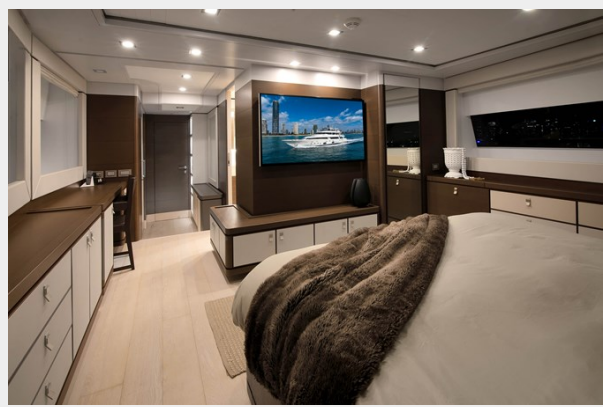
51. Accommodation Master (9)