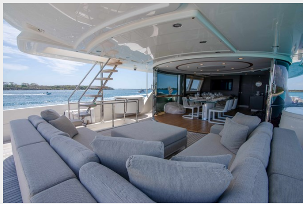
30. Customline 33m photos (2)