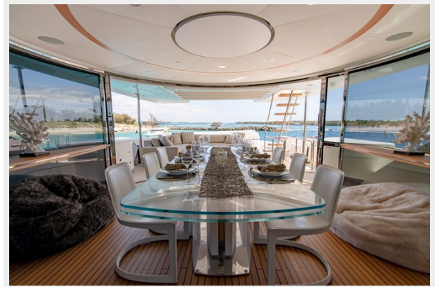
33. Customline 33m photos (3)