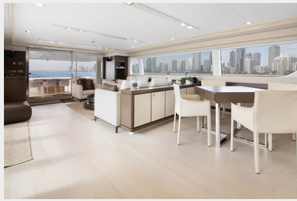
47. Customline Navetta 33 - Pinnacle (8)