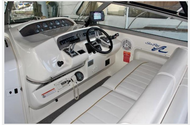
Helm Starboard View